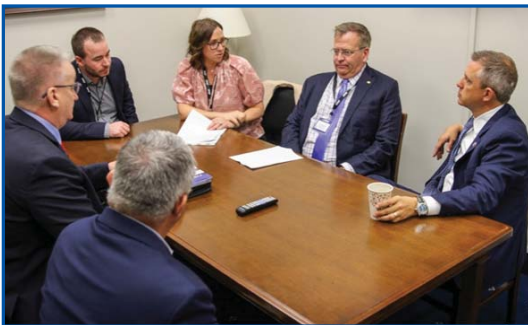
NDPMA meets with Congressman Armstrong

I caught up with the North Dakota Petroleum Marketers in DC today. We are working to address the shortage of CDL drivers in the state to help get our goods to market.