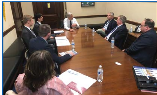
NDPMA meets with Senator Hoeven