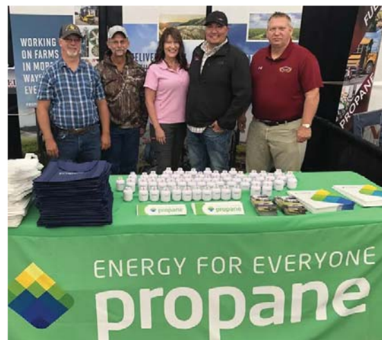
Propane booth at the Big Iron Show