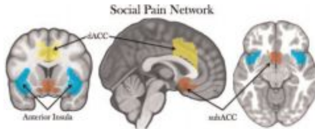
Fig. 1 The social pain network, constructed using the union of anatomically defined AI, subACC and dACC.

Participants were instructed to rate their level of agreement with 20 statements on a seven-point scale ranging from ‘strongly disagree’ to ‘strongly agree’ (e.g. ‘I did not feel accepted by the other players’ and ‘I believed that my contribution to the game did not matter’). Results were coded such that higher scores indicated increased feelings of threat or distress.