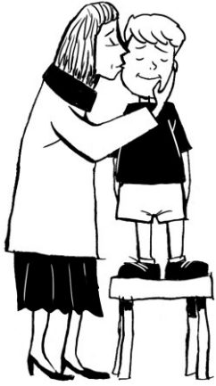
Figure 1: Example target picture.