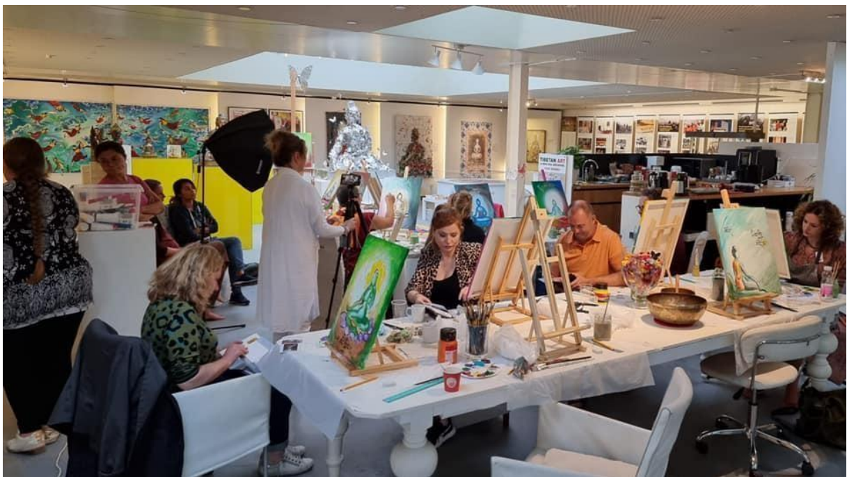
Workshops in our Museum sponsored by the Municipality of Emmen

In June the Museum participated in a workshop (full day from 9am – 5pm full ) for provincial museums organized by the Drenthe Museums Co-ordinator. Such events are happening several months during the year. Museum staff learned how to best use smartphones for making films, how to handle museum art and artifacts, etc. More workshops and events were followed in August.