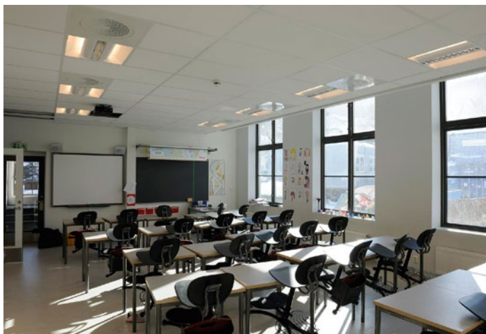
Danvig Skole, Drammen, Norway