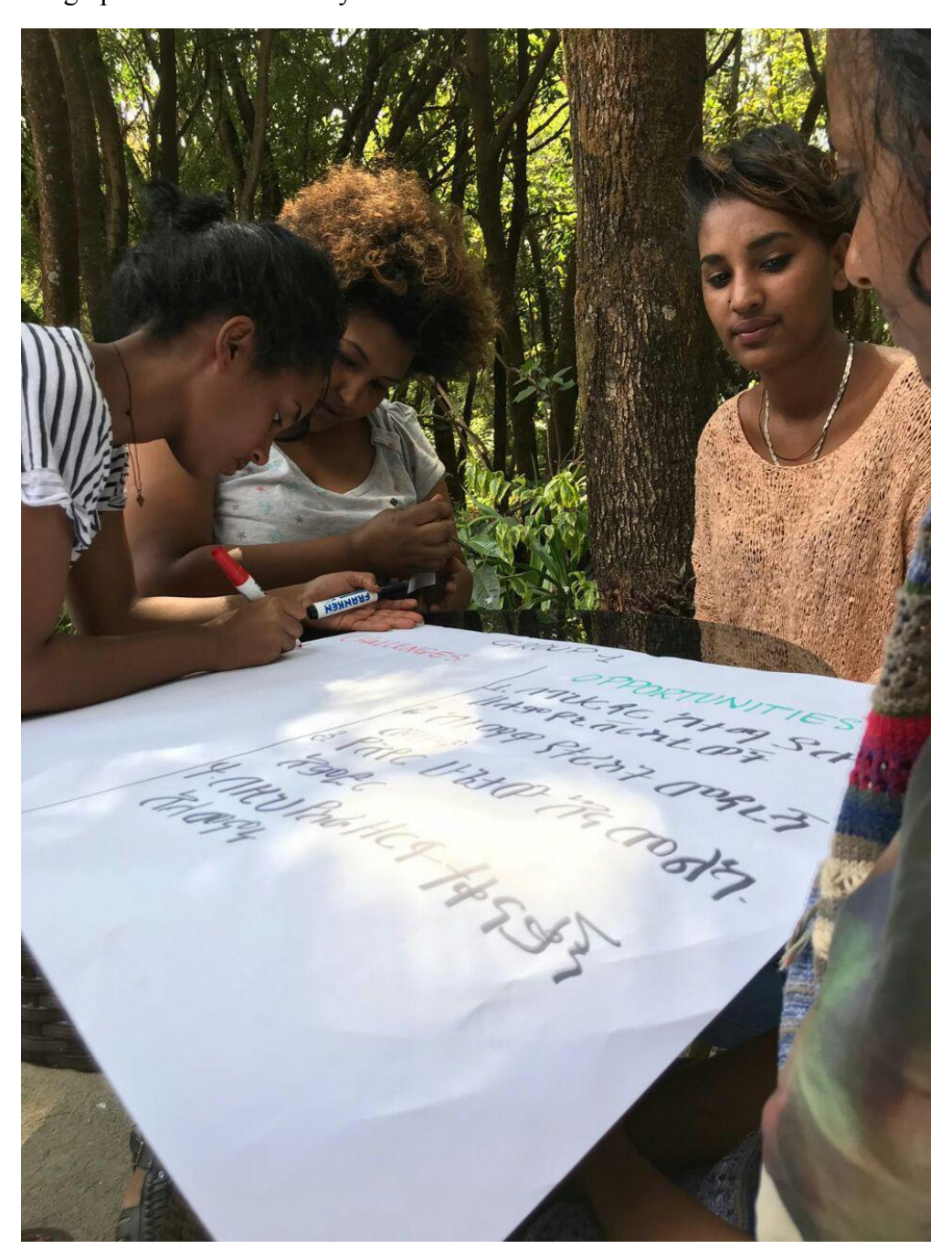
Trainees doing group exercises

Nobody has faced a serious health issue from the trainers' side and only one trainee was suffering from a headache in the last day of the training and the team provided her with a medicine and has been following up her till the final day and found her recovered.