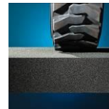
High compressive strength