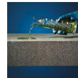
Acid resistant / chemical resistant