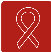
Human toxicity, cancer