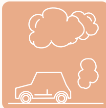
Photochemical ozone formation