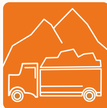
Resource use minerals and metals