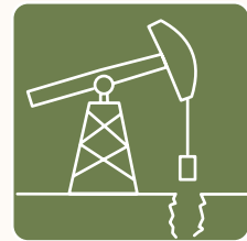
Resource use fossils