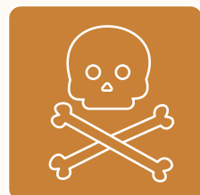
Human toxicity, noncancer