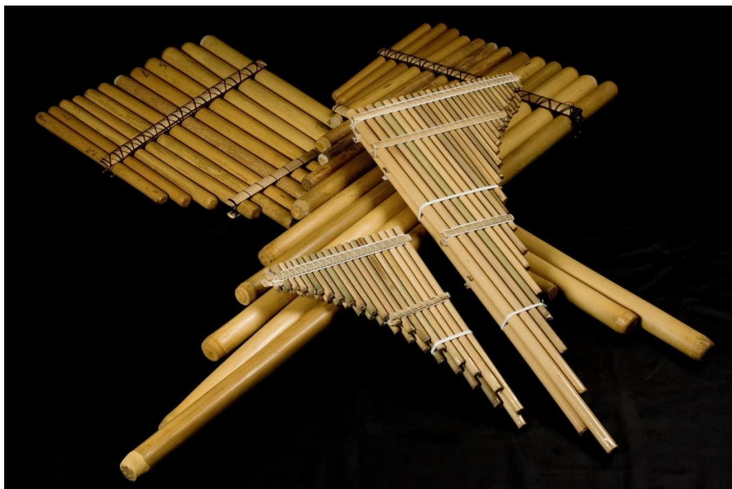
Figure 5. The family of the siku. The longest siku is the chirihuanos . The middle siku is the ayarachis and the small siku is the malta used by Ponce.

8) The rondador (panpipes originating in Ecuador) player blows two canes at the same time, producing a third, quarter or fifth interval.