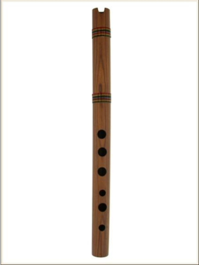
Figure 1. The quena

Andes folk music. There is already a long tradition of playing these instruments, and since the 1920's thousands of siku and quena players have performed Andes traditional music in Latin America. (Cf. Appendix III, CD track 2).