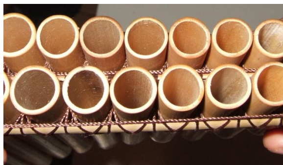
Figure 4. Canes and notes of the siku.

One or two persons play the siku normally in e-minor or in a pentatonic scale, in the last case as a conversation. Ponce, an important siku player in Bolivia, plays jazz music that incorporates these ideas in the techniques of the instrument. He found the songo (South American bamboo) in La Paz (Songo valley). Songo gives this instrument its unmistakable sound, different from the European panpipes, and facilitates different dynamics. (Cf. Appendix III, CD track 12)