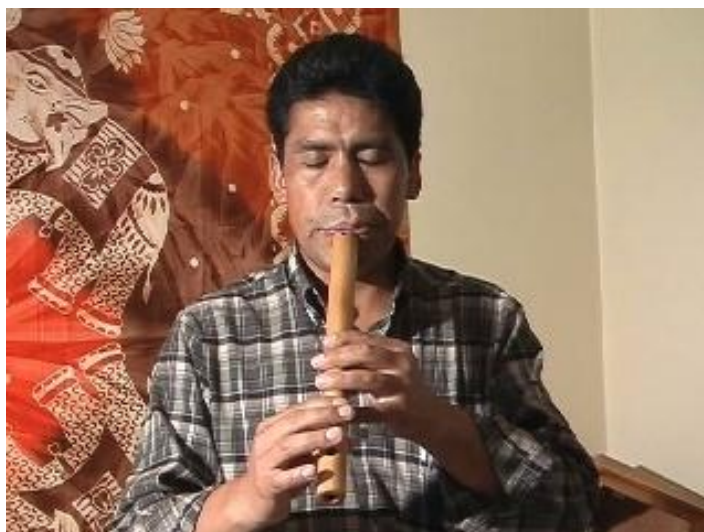
Figure 7. Position and balance of the quena by Arias.

The balance between the weight of the instrument and the body is concentrated on the tip of the toe, with a straight back, and the arms placed neither high nor low.