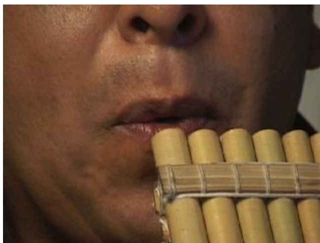
Figure 6. The embouchure of the siku used by Ponce.

A good embouchure is focused on the lower lip, which must search for the right position in the middle of the cane. The upper lip will focus the air towards the cane and in this way search for the right position of each cane. To get a good sound, the upper lip must vibrate lightly while the player is performing and has to be a little forward in relation to the lower lip. In order to get the right “siku” sound, it is important to notice the light sensation of vibration of the upper lip and to understand the process of the air in the canes. The air will flow to the bottom of the tube and make contact with the side of the cane where the lower lip is placed. When the air comes back, it will come out from the other side of the cane. In this way it will produce the unique resonance of this instrument, tickling the upper lip, making it quiver. With a bad embouchure the sound will squeal or turn into a round sound. (Trans. De La Calle)