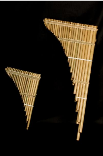
Figure 2. The siku