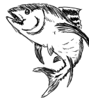
TEKKA / MAGURO