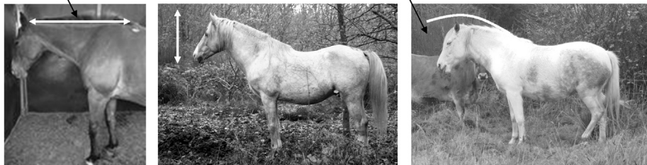
a) “withdrawn” b) standing observing c) standing resting

Fig. 1. The posture of “withdrawn” horses. Pictures of a horse (a) in a withdrawn posture, (b) standing observing and (c) standing resting. The withdrawn state is characterised by a stretched neck (obtuse jaw–neck angle) and a similar height between the horse’s neck and back (a nape–withers–back angle of \approx 180^\circ ). This posture is different from those associated with observation of the environment (for which the neck is higher), and resting, when eyes are at least partly closed and the horse’s neck is rounder (Waring, 2003; Fureix et al., 2011b). Note that the restricted size of the stall (3 m \times 3 m) prevented the authors from taking a picture of the whole horse displaying the withdrawn posture, as we chose to use the same lens to limit shape distortion between images.