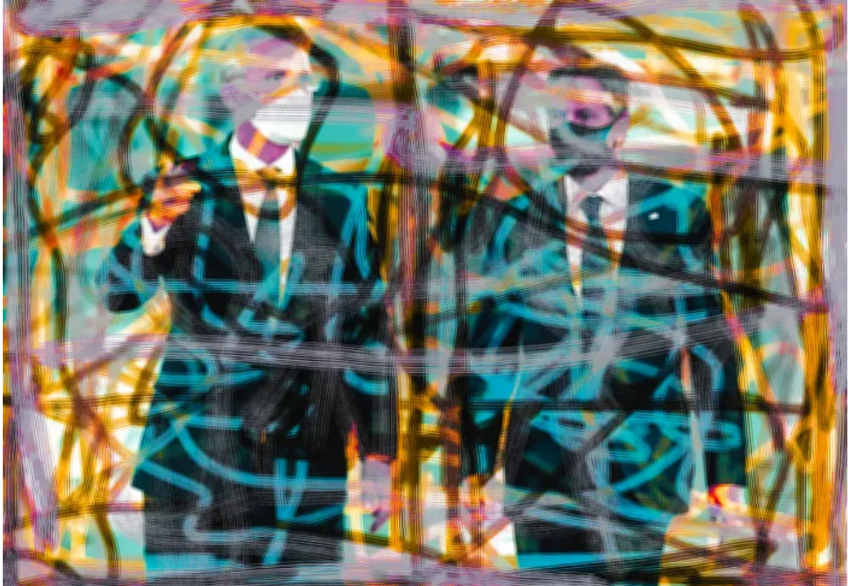
Masking the truth Secretary of State Antony Blinken and NATO's chief Jens Stoltenberg