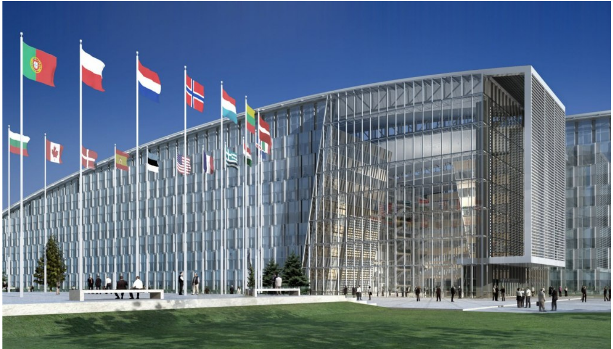
NATO's Mausoleum 2018

To learn more and find out how much you are not told when you listen to NATO's representatives and advocates arguing permanently for higher and higher contributions from all members. The relevant figures are here and here and here .