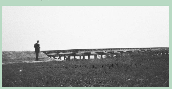
The railway track for the marl delivery via Ribe Holme in 1930.

From the end of the 19<sup>th</sup> century until the middle of the 20<sup>th</sup> century, the farmers marled the sour parts of the land. At the farm Klåbygård, two marl pits existed from 1910 to 1951. Via small railway tracks, which were connected to the main railway, the marl pits provided lime filled nutrition for large parts of the inland and the marshlands.