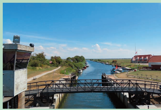
During storm surge, Kammerslusen is closed, thereby keeping the inhabitants of the marshlands safe from flooding.

From 1855-1856, the mouth of Ribe Å was moved north, and a canal for a more direct entrance was dug. In 1918, the meander was cut off, and from 1954 the embankment near Ribe made it impossible for larger boats to enter Ribe. The Ribe Dike and Kammerslusen (chamber sluice) stood finished in 1912. Kanalhuset (the canal house) used to have an inn and a quarantine station.