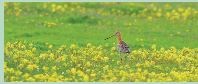
A bar-tailed godwit in the marsh.

The Wadden Sea National Park is habitat for more than 10.000 species of animals. Every year, over 10 million migratory birds visit the area, where you also will find oysters, bivalves, and seals. Salmon, trout, houting, and otter live in the stream Ribe Å. The vegetation varies from the tidal meadows at the mouth of Ribe Å to the meadows near the geest (higher ground).