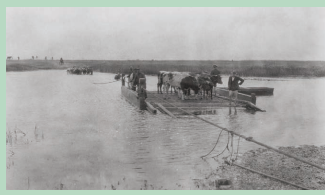
Transportation of cattle on a barge on Ribe Å.

In 1294, king Erik VI Menved donated the islet Ribe Holme to Ribe. The town had a publicly funded breeding bull that grazed on the southern tip of the islet, Tyreng (bull meadow). The citizens of Ribe paid a cowherd to control and secure the field boundaries, the hay distribution, and the grazing of the cattle. Every summer until the 1930'ies, the owners of Ribe Holme held Holmefester (islet parties) during the hay harvest.