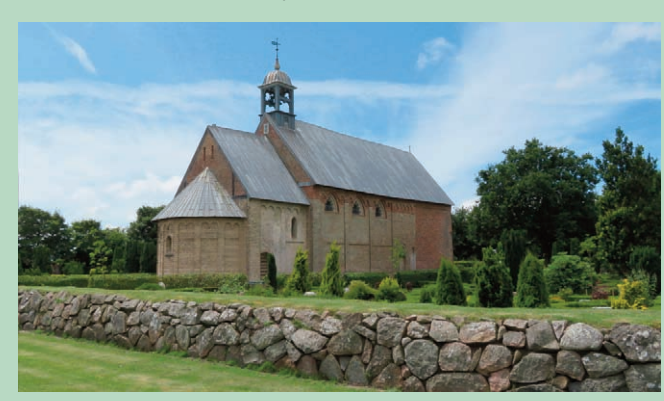
Hviding Church.

In the Danish part of the Wadden Sea, the volcanic tuff stone was used for many church buildings. Five out of the six of the nearest churches are partly or entirely built of tuff: Ribe Cathedral, and the churches in Vilslev, Farup, Vester Vedsted, and Hviding. St Catharine's Church in Ribe is built of clay bricks.