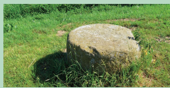
According to myth, a giant or a troll lived on the island Mandø. He wanted to hit Ribe Cathedral with this huge stone – and his "fingerprints" are still visible on it.

According to the myth, a giant or a troll threw it here. At this place, there was a landing-place for the ships that carried goods and merchandise to and from Ribe. An annual race, Æ Quernsteensløb, is held in the autumn.