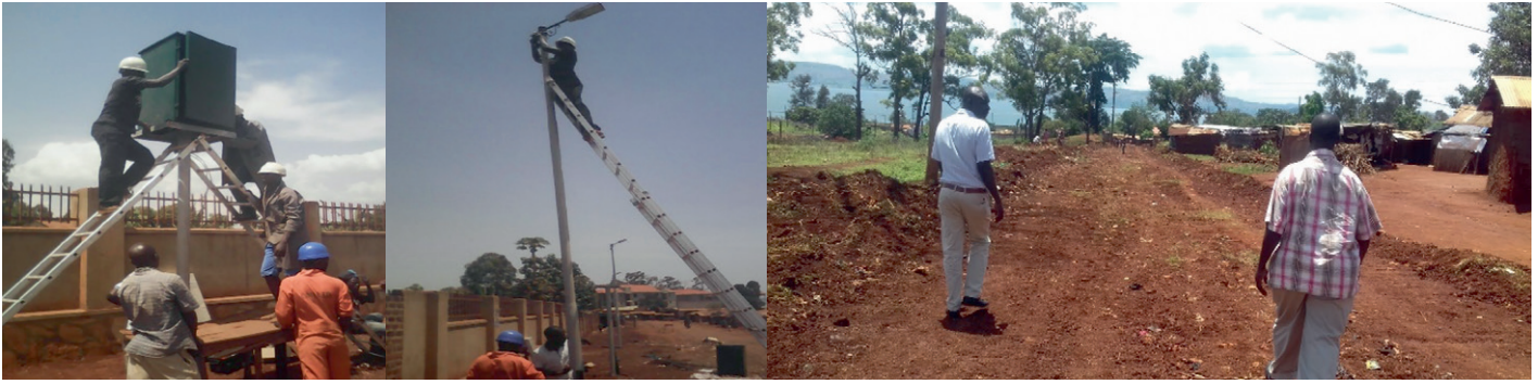
Picture 2: Trained NSDFU teams installing street solar lights along Kulazikulabye road (left and centre) and NSDFU coordinators inspecting the Mwangu road during the process of widening and opening new roads in the Kibugambata settlement in 2017 (right).

By the end of 2014, the plan had been approved by both the community and the JMC, which made available a small budget for the redevelopment of the settlement. Together with budgets provided by ACTogether and Slum Dwellers International, small parts of the plan have been implemented with technical support from the JMC, starting with the installation of street and household solar lighting along three roads, the creation of new roads and the widening of existing roads, the construction of the public toilets and the trade centres. While the solar project encountered various challenges and cases of cable theft (cables to houses were cut off), 20 solar street lights were added in 2018 to increase security in the settlement. The JMC subsidised 10 per cent of the cost of the 350 solar packs provided to beneficiary households as way of contributing joint efforts to transform the Kibugambata community.