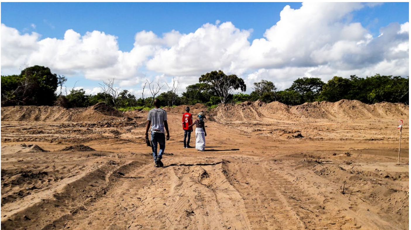
Figure 7: Community members showing construction site

Since October 2017, a series of deadly attacks on state structures and civilians has taken place across the province of Cabo Delgado. At least 75 had occurred by the end of August 2018. Human Rights Watch reported 39 deaths and