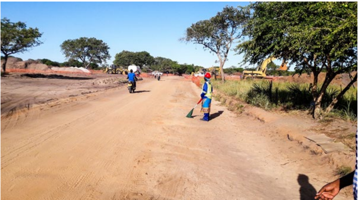
Figure 1: LNG investment companies already clearing land for the resettlement houses in Quitunda zone in Senga village

The process of LNG investment and development has already started in the communities within the project's DUAT. Visits to Quitupo, Maganja, Senga, and Monjane further affirmed the existence of steps in an ongoing LNG development process. This section briefly discusses the ongoing resettlement plans and developments in the four surveyed communities.