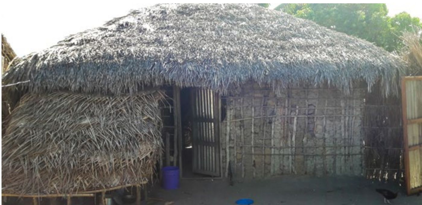
Figure 3: House in Quitupo (mud-based with grass-thatched roof)

developments including a road, mosque, hospital, and several other socio-economic facilities and services, which would be realized prior to taking the land. In addition, individuals who are now cultivating the land would be compensated for the crops and trees in the area, and for now were still allowed by the project to continue planting short-term crops until the land is officially demarcated. According to our respondents, no alternative land will be provided by the project. Instead, they will have to look for other areas in Monjane to clear and start cultivating. The chairperson of the Community Resettlement Committee reported that this is still possible: "There is still free land. You can even get it tomorrow if you wanted to" (Committee chair, Monjane). However, this assumption might underestimate the complexity associated with not one or two but a large number of residents suddenly searching to acquire agricultural land in the area. It also overstates the amount of land available for Monjane residents to occupy, given increased pressure from immigrants and companies who are looking for opportunities with the LNG project. Overall, most respondents from Monjane responded positively about the Quitupo community receiving farmland in their community, highlighting the promised benefits by the project. Nonetheless, a number of respondents were more concerned and explained that