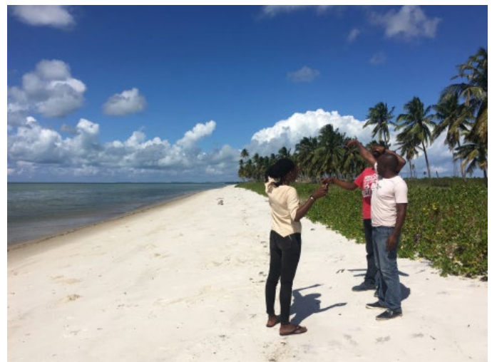
Figure 5: The location of the future Industrial Zone