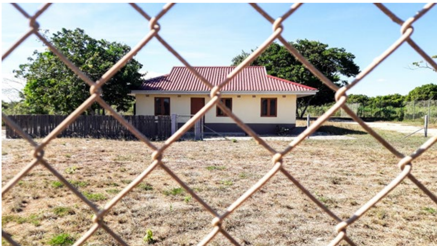
Figure 6: The proposed house design for communities to be resettled

gado are part of a larger picture of investments and have the potential to contribute substantially to development and livelihood improvement of communities in the province and beyond. At the same time, negative impacts (including loss of livelihoods, increasing scarcity of land and other resources, companies-community conflicts and marginalisation of women) are also foreseen. Based on this research, and in comparison with other experiences with extractives in Mozambique and other countries, it was seen that a substantial part of discontentment with such projects stems from the inability of projects to deliver the immense promises made to communities and that communities do not share the benefits of the projects in the long term. This relates to the issue that communities are often insufficiently informed about the potential negative impacts of the project. To address this and other challenges, and better align the LNG investments with local priorities, several steps can be taken: