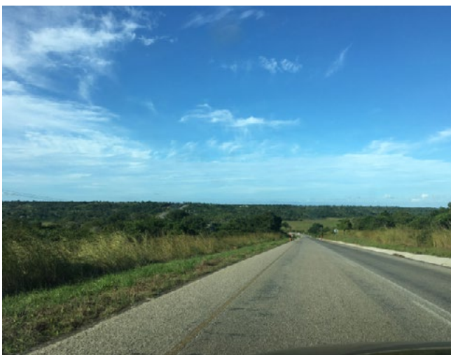
Figure 4: A Newly constructed road from Pemba to Palma

The companies have constructed and, where needed, improved the roads leading to all the four communities visited (figure 4) and also contributed to the construction of a hospital in Ma-