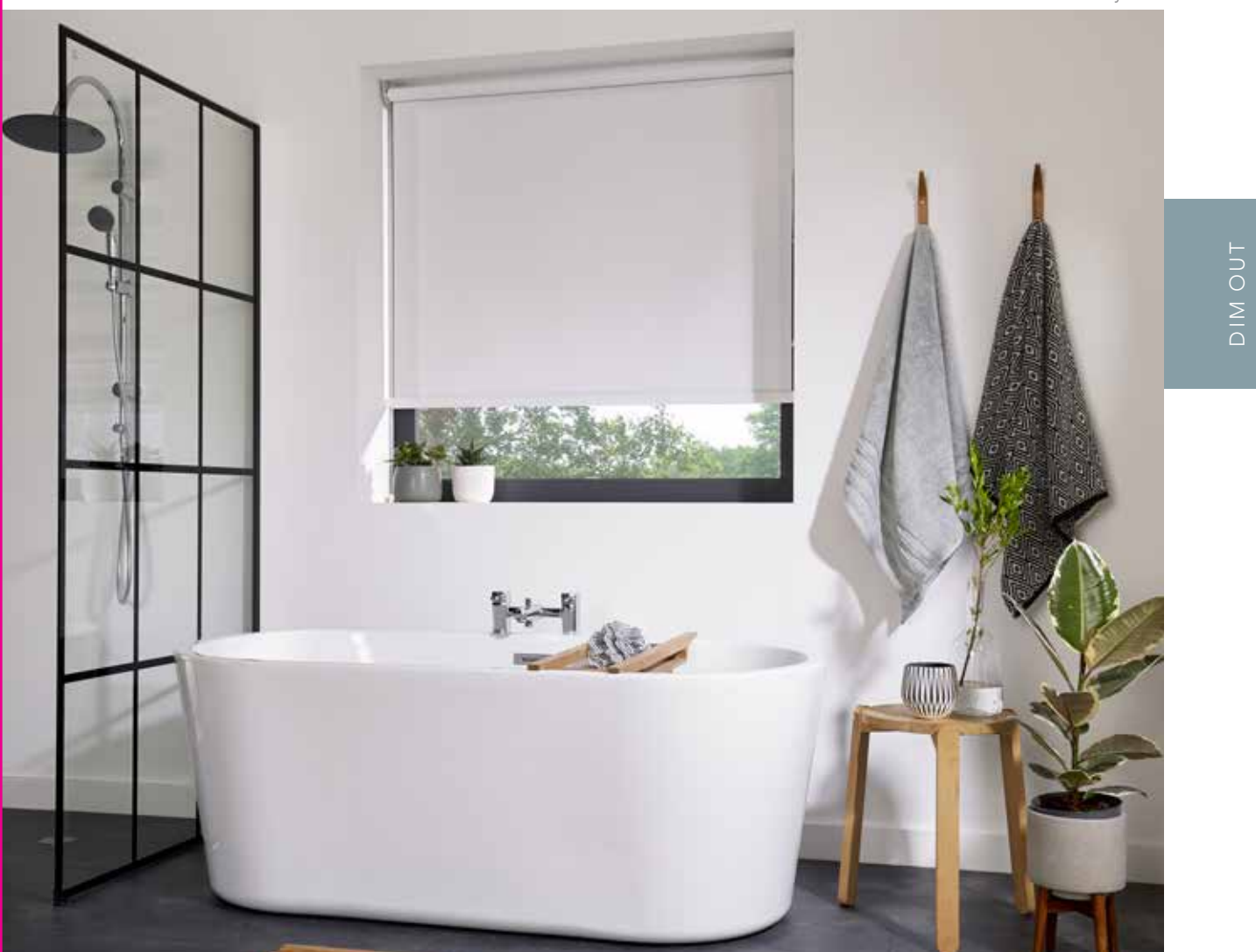
Pictured: Carnival China White - Guide Wire System