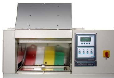
Solarbox 3000e: table top xenon testers 4 models