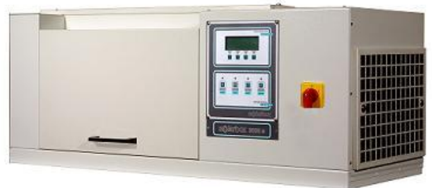
SOLARBOX 3000 E

Consequently, because the temperature produces an accelerated ageing, it is essential to be able to control of B.S.T. during exposure to filtered Xenon radiation.