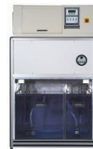
SOLARBOX R.H. with Humidity Control

We reserve the right to make changes to equipment and systems in response to advances in technology and modify parameter values accordingly.