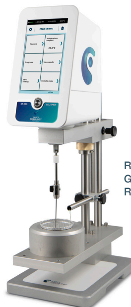
Ref. N125000 GT-300 GEL TIMER ROOM T°