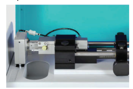
Press start and begin the measurement