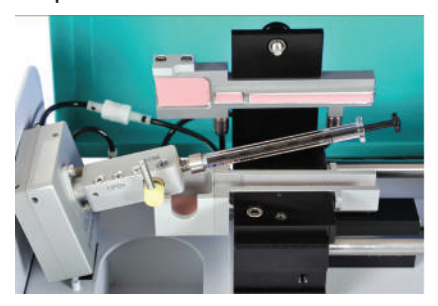
Load the syringe with sample.