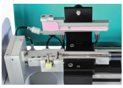
Thread the syringe into the measuring cell and close the thermal jacket