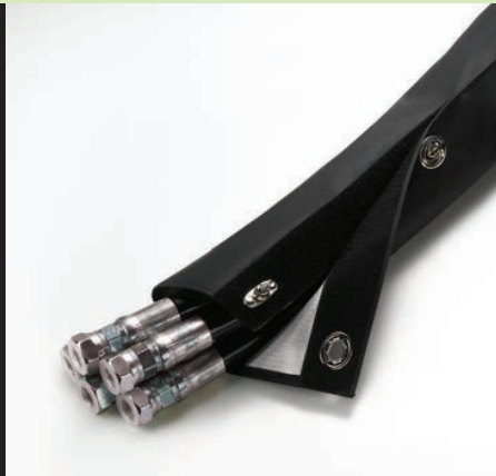
Special version with eyelets