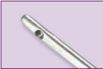
Tapered Tip, Port on Underside