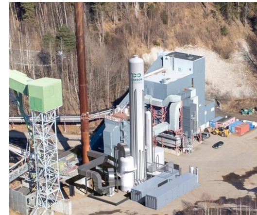
Hønefoss 100.000 TPA. Bio Operational target: 2029