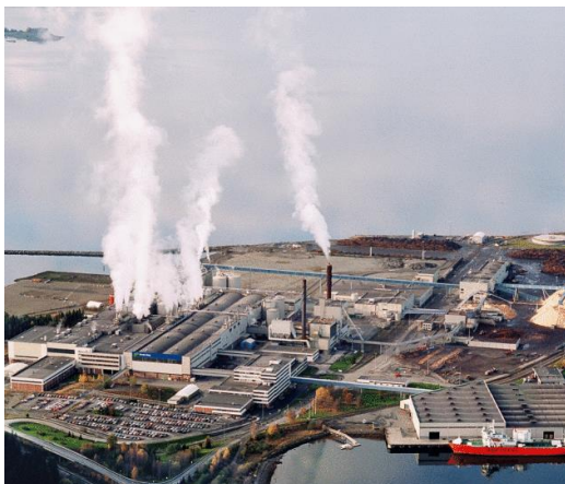
Skogn, Norway 100.000 TPA. Pulp & Paper Operational target: 2029