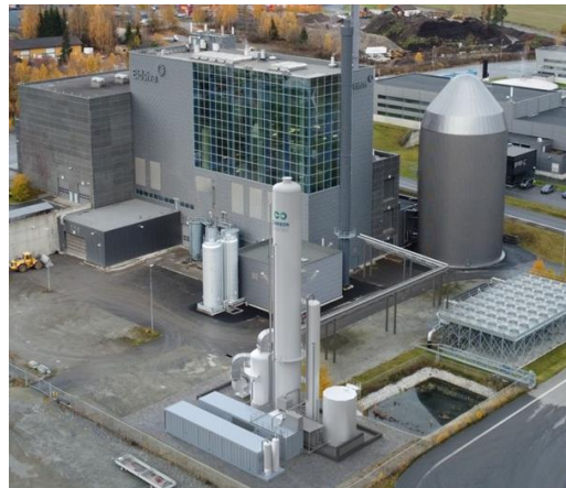
Hamar (Norway) 70.000 TPA. WtE Operational target: 2029