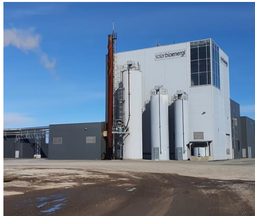
Kirkenær, Norway 32 000 TPA. Bio Operational target: 2028