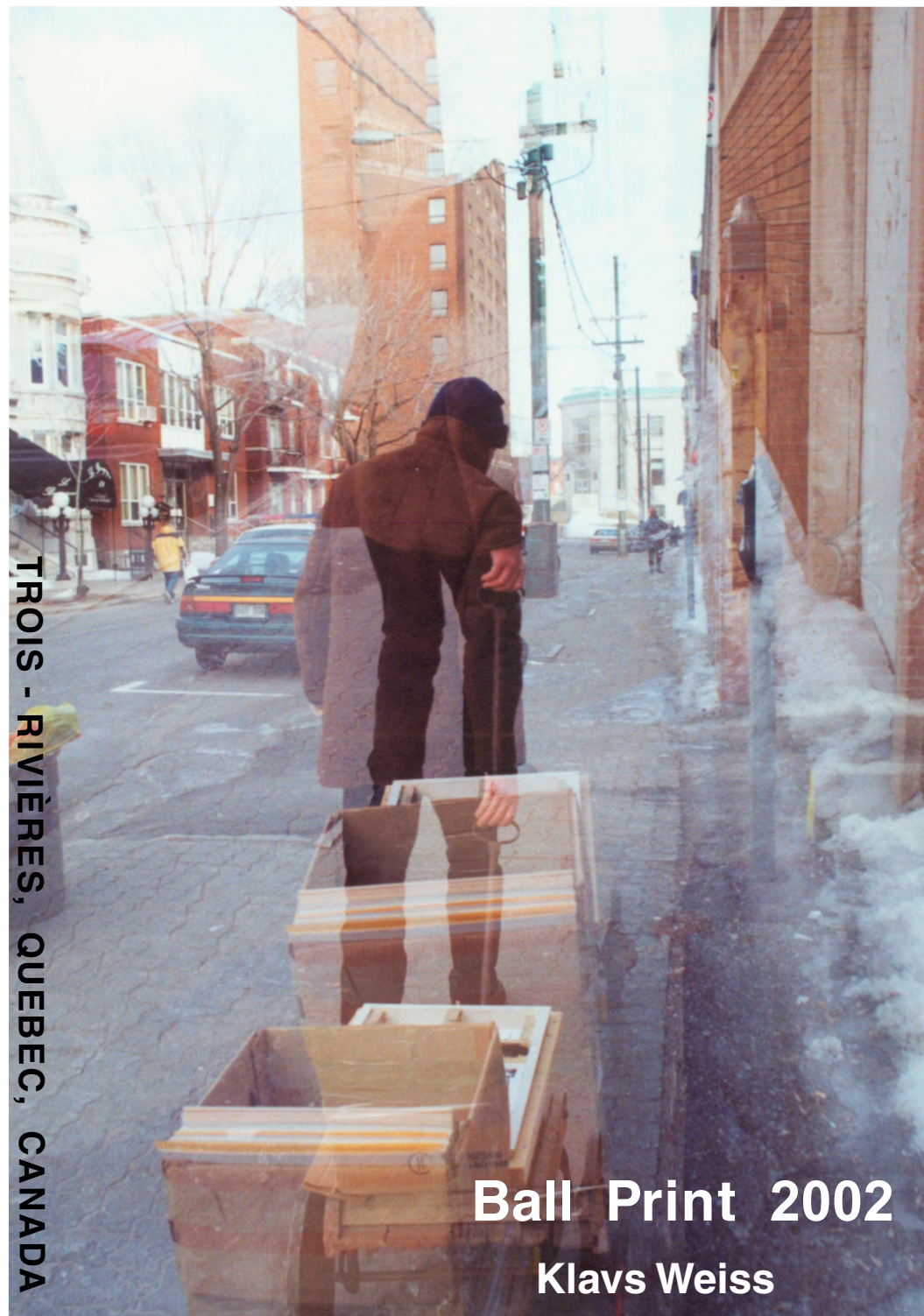
TROIS - RIVIÈRES, QUEBEC, CANADA