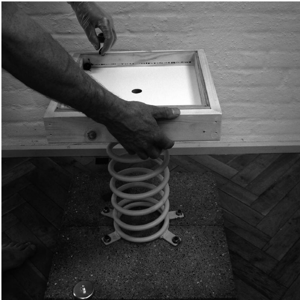
the inked iron ball is placed on the paper, and at the same time the wooden tray is pressed down