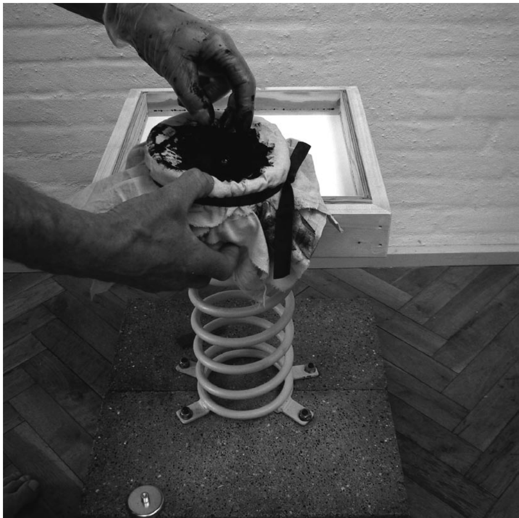
the iron ball gets inked