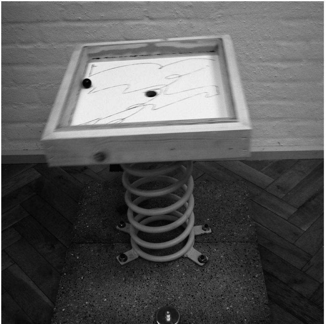
let go the hold on the tray, the tray is moving, the ball is rolling and printing