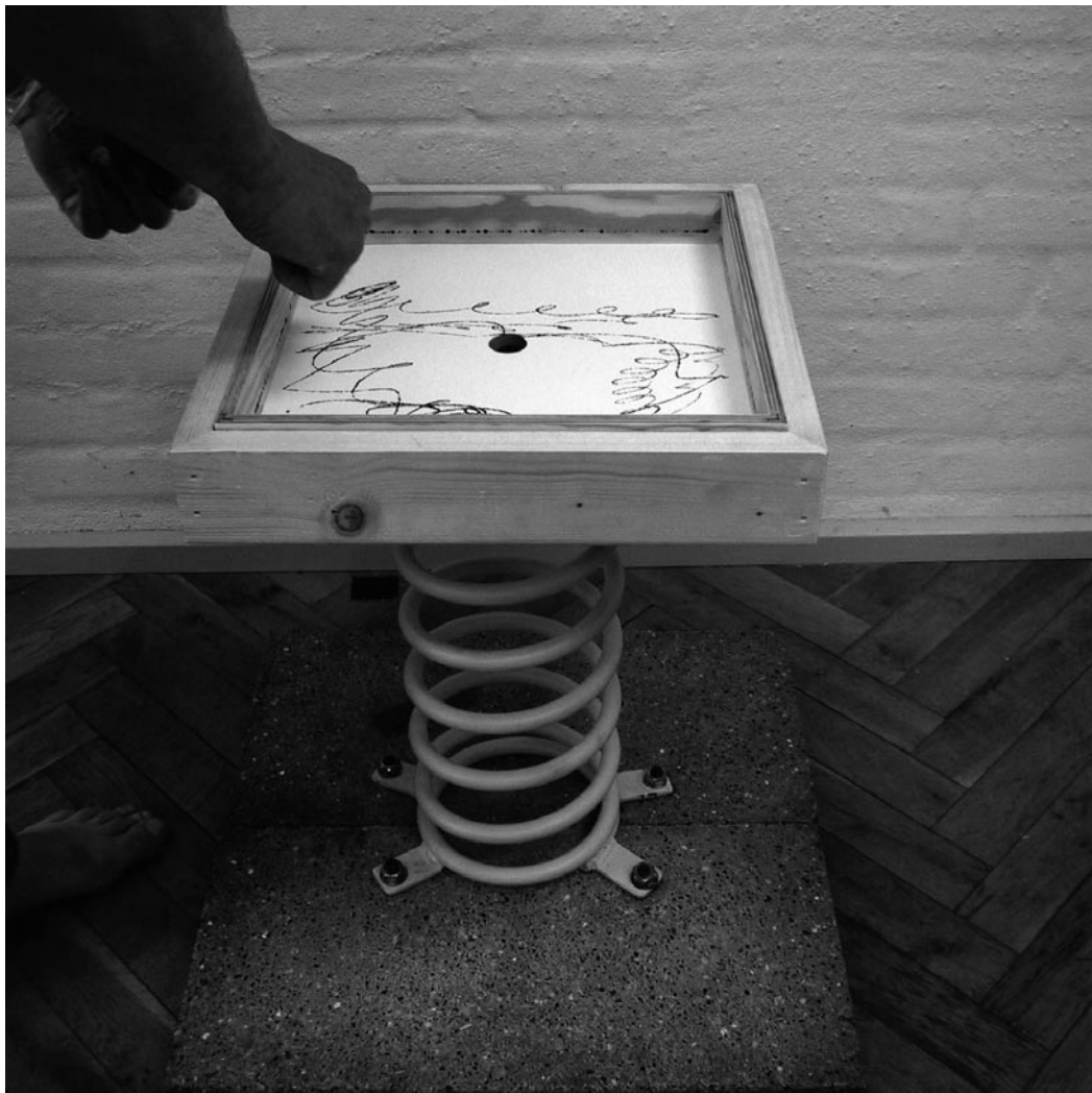
the »inner frame« is removed