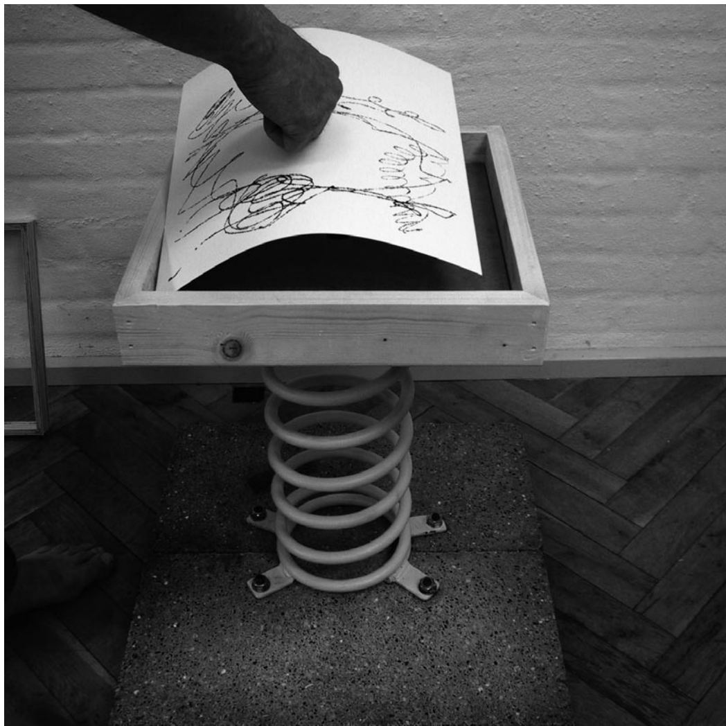
the finished print is removed