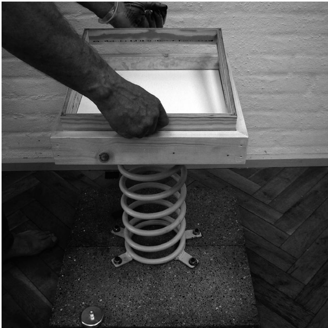
the »inner frame« is placed on the paper