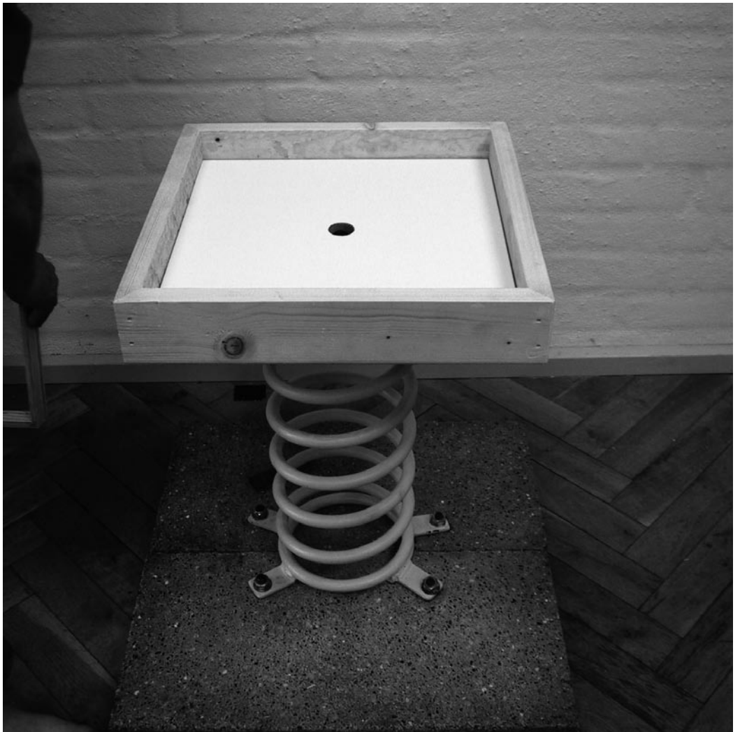
a new paper sheet is placed at the bottom of the wooden tray