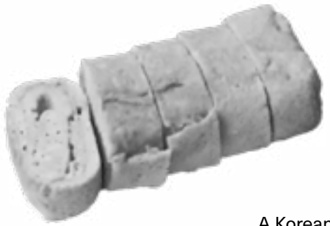
A Korean dish made by frying thin layers of egg and rolling them up.