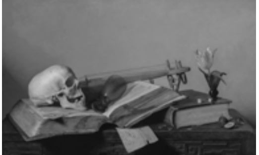
A still life artwork which includes various symbolic objects designed to remind the viewer of their mortality and of the worthlessness of worldly goods and pleasures.