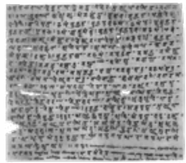
A famous Buddhist text in Mahāyāna Buddhism, and its title means "The Heart of the Perfection of Wisdom" in Sanskrit