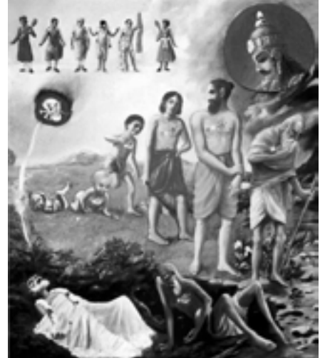
Reincarnation, or "Samsara" in Sanskrit, is the concept that after death, a soul is reborn into a new body. This cycle of birth, death, and rebirth continues until the soul achieves enlightenment and is freed from the cycle.