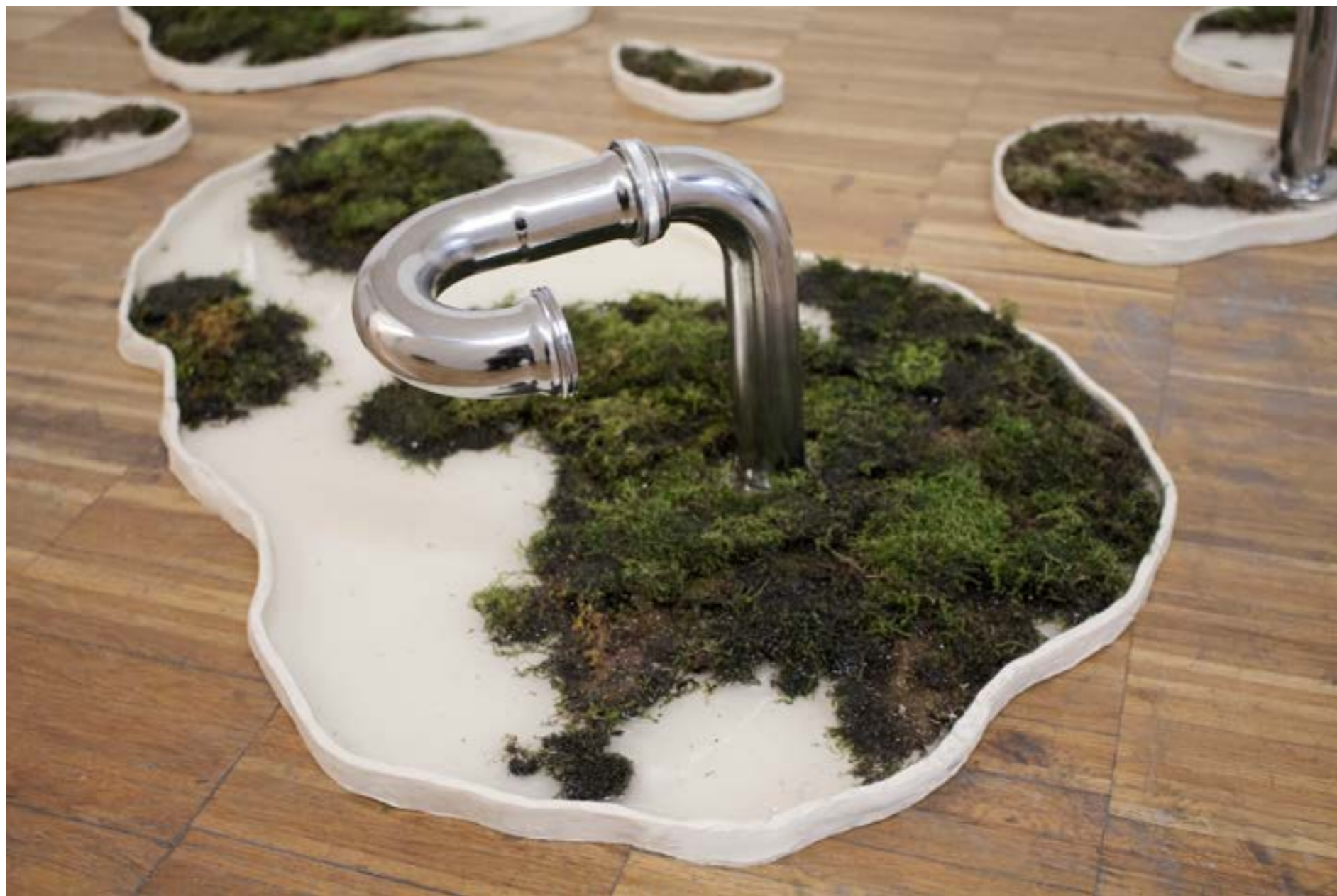
l'kki ceramic, moss, epoxy, pipes, dimensions variable (2023)