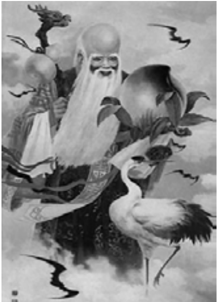
In Chinese mythology, the Peaches of Immortality are believed to grant longevity to those who eat them. They are a common symbol in Chinese art, often depicted alongside deities, immortals, and other symbols of longevity like deer and cranes.