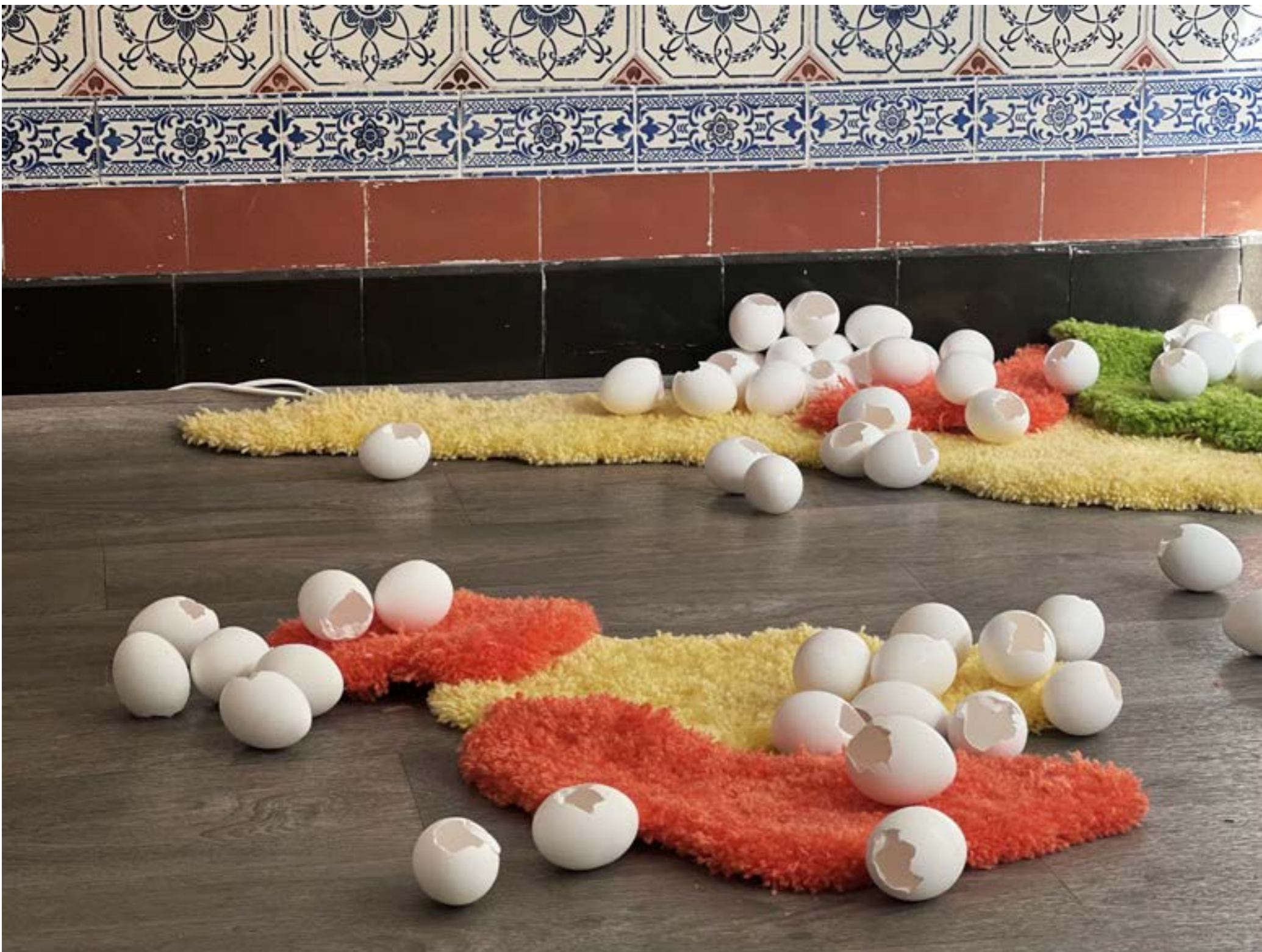
The things that made me... eggs, tufting rugs, light bulb, dimensions variable (2022)