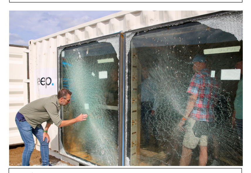
Keep's system protects what is on the inside

Keep is revolutionizing the market for secure facades, windows and doors through its patented solution that protects against explosion, smash and grab, burglary, fire and shelling