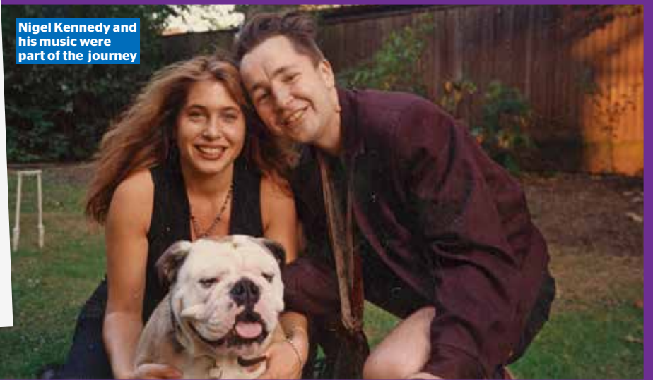
Nigel Kennedy and his music were part of the journey

for spiritual people, because it's believed to have a ley line running through it. I started getting into the energy of crystals, and bought a few to have around my home and did a flotation tank.