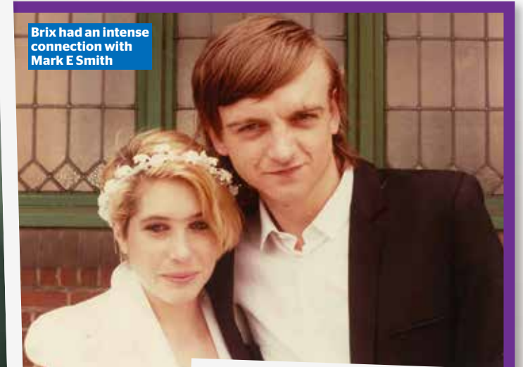
Brix had an intense connection with Mark E Smith