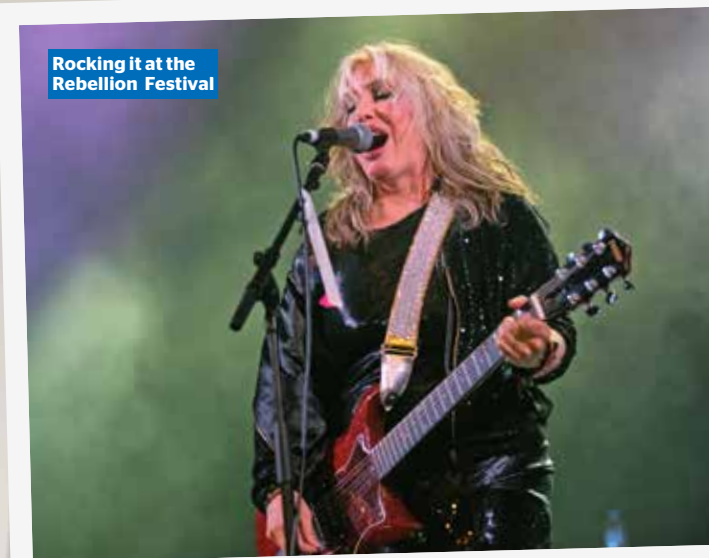
Rocking it at the Rebellion Festival