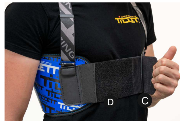
Front strap has been tightened through point C and D. Firm across the chest, not over tightend.