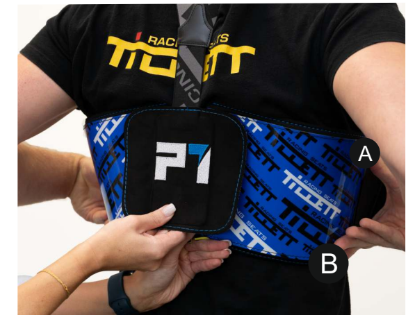
Place back panel onto velcro strips. (May require assistance)