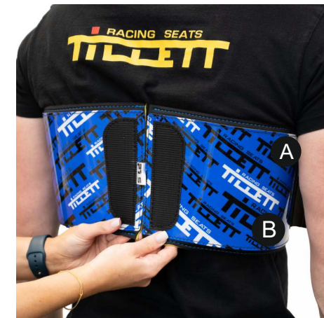
Angled chest. No overlap with equal pressure at point A and B.