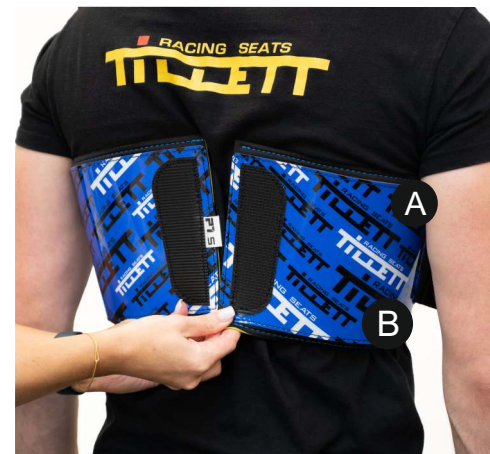
Angled chest. No overlap with equal pressure at point A and B.

Please ensure that the P1 Rib Protector is worn inside the race suit over a thin T shirt. Ideally, low profile washers and bolts should be used to minimise any pressure points and avoid damaging the race suit.