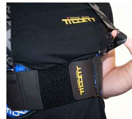
To adjust the harness, simply pull the strap (Part A) away from the driver to undo the lever clip (Part B).