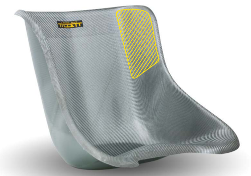
Contact area between seat and Rib Protector