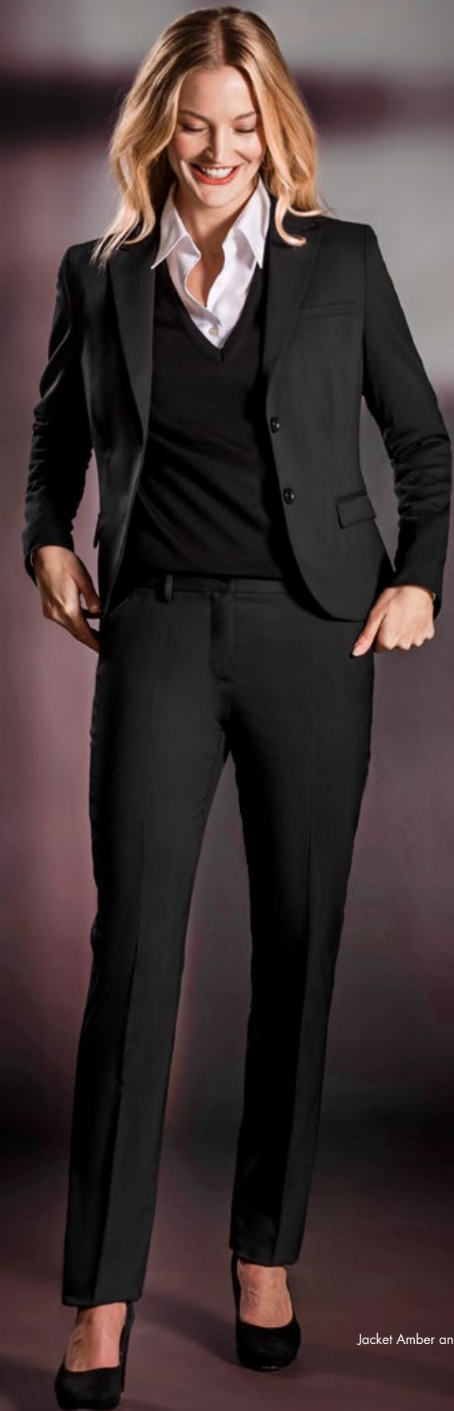
Jacket Amber and trousers Marie, page 22.