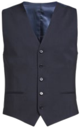
5. BEN SLIM FIT TWILL SUIT ART.NR: 7130-1010 Waistcoat. Slim fit. Two front pockets. Lining fabric in the back. Mix and match. MATERIAL: 60% wool, 38% Polyester, 2% Lycra stretch. COLOUR: 10 Black, 12 Grey, 30 Navy SIZE: B44-58 average