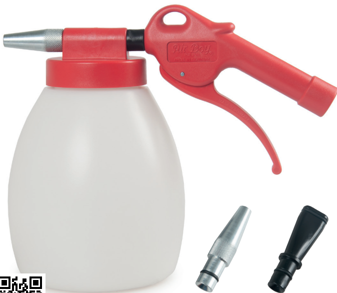
Precision nozzle 145950-000

NB! requires a compressor with a capacity of at least 2.5 HP / 180 l/min.