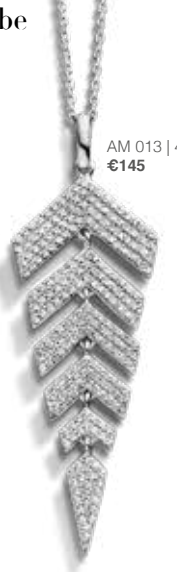
AM 013 | 40+5cm €145