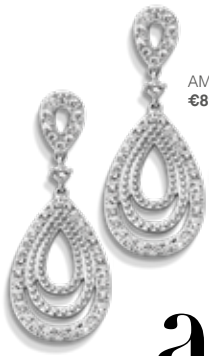
AM 136 €89