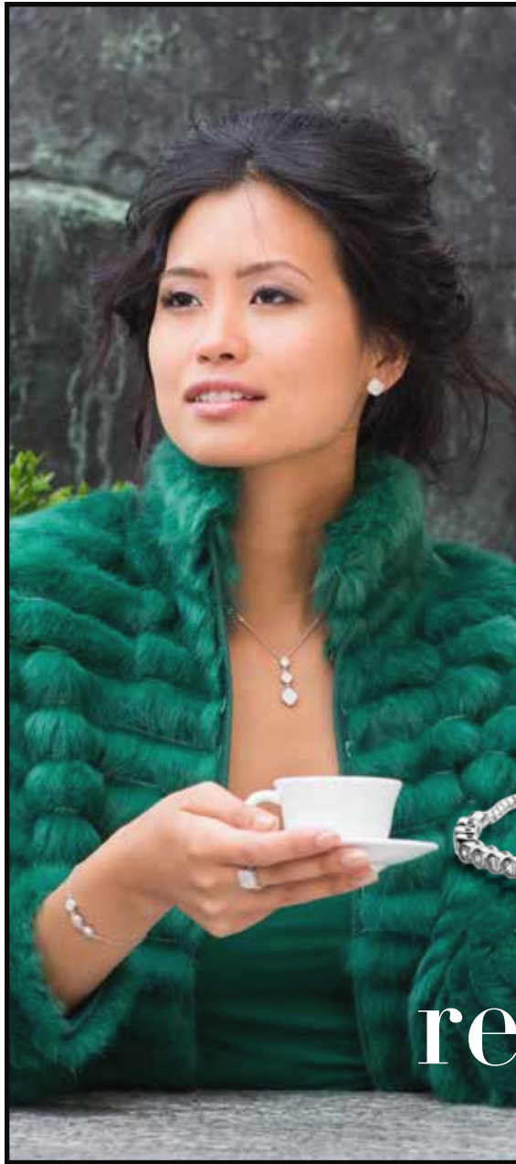
AM 140 | 40+5cm €139