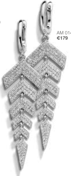
AM 014 €179