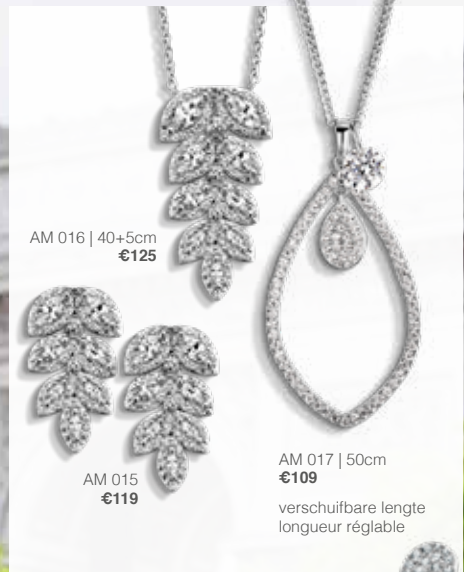
AM 016 | 40+5cm €125