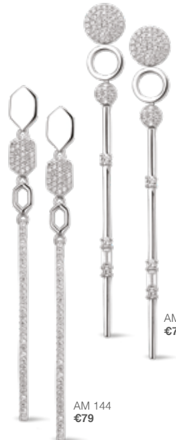
AM 144 €79