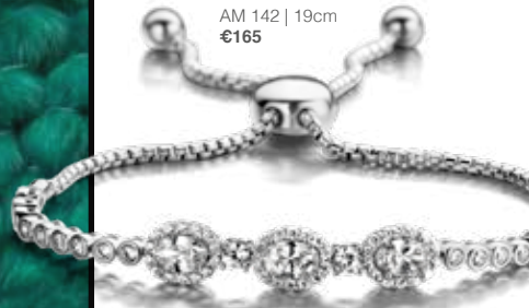
AM 142 | 19cm €165