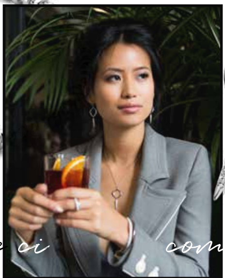
AM 005 | 19cm €249