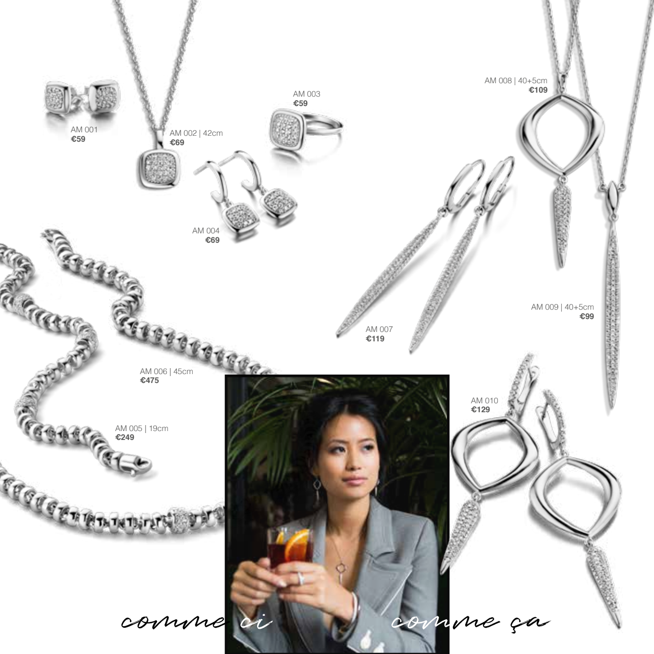
AM 001 €59