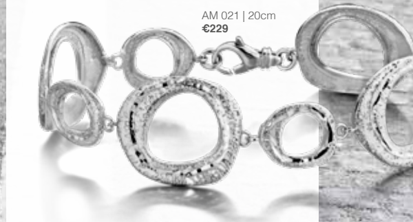
AM 021 | 20cm €229