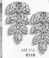
AM 015 €119