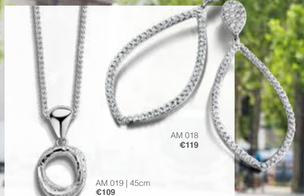
AM 018 €119