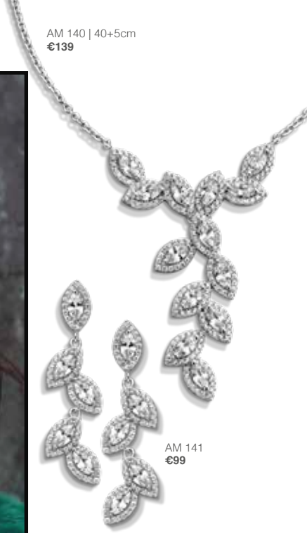
AM 141 €99