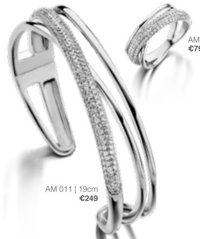
AM 011 | 19cm €249