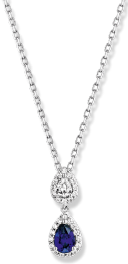
Halsketting N8C24 · € 99