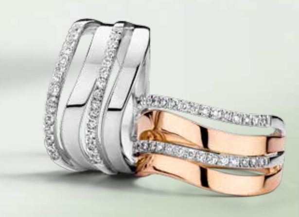
CLASSIC WITH A TWIST