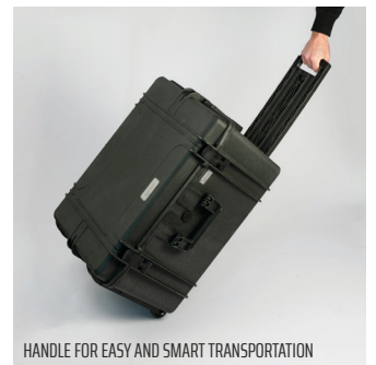
HANDLE FOR EASY AND SMART TRANSPORTATION