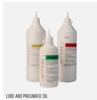
LUBE AND PNEUMATIC OIL