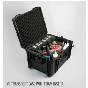
V2 TRANSPORT CASE WITH FOAM INSERT