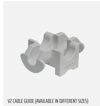
V2 CABLE GUIDE (AVAILABLE IN DIFFERENT SIZES)