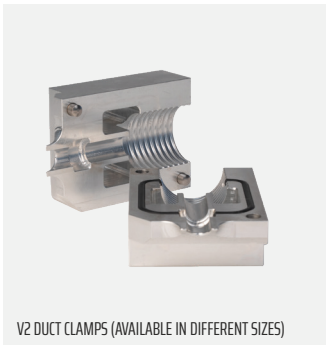
V2 DUCT CLAMPS (AVAILABLE IN DIFFERENT SIZES)