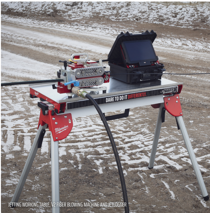
JETTING WORKING TABLE, V2 FIBER BLOWING MACHINE AND JETLOGGER