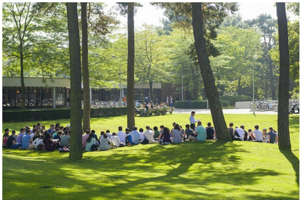
Lecture in the open air on a summer day

Tilburg University has a green campus and is located on the edge of a park-like forest. The campus itself is bustling with student activity, a contrast that makes Tilburg University a truly attractive and dynamic place for learning. Tilburg University has a modern University Library and excellent Sports Center, which are all within easy walking distance from each other. Student work spaces in every building are equipped with all the modern facilities you need to make studying on campus a pleasant experience. Organizations aimed specifically at international students organize all kinds of social activities. All ingredients are there to give you a stimulating, inspiring, and joyful campus experience.