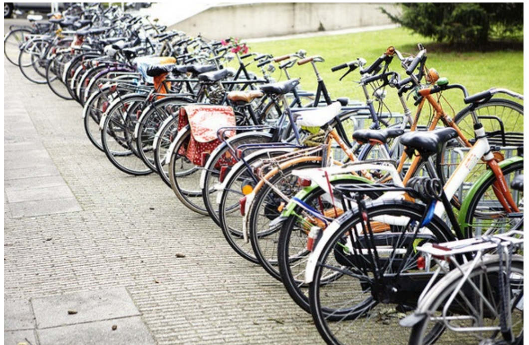
Bikes parked at the Tilburg University campus

Research Universities offer the highest level of education available in the Netherlands. Education at a Research University is more theoretical and at an academic level, aimed at developing critical thinking skills, preparing students for either a professional or academic career. Universities of Applied Sciences ( HBO ) offer more practice-oriented education which prepares students for specific professions (e.g., physiotherapist, primary-school teacher, or hospitality manager).