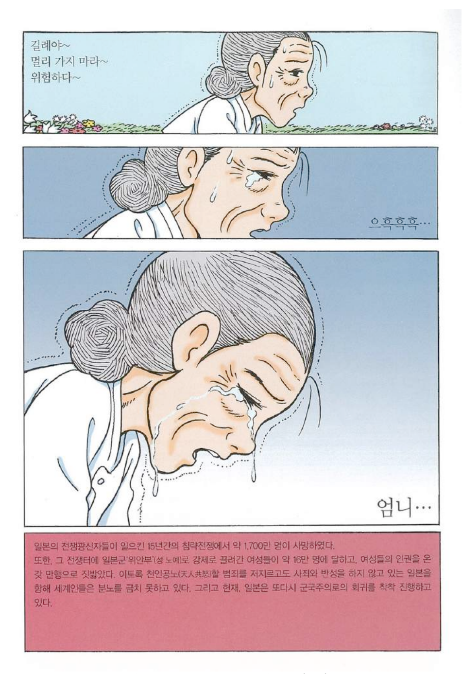
Fig. 3 Last page from Choi Shin-oh 70 Years of Nightmare (2014).