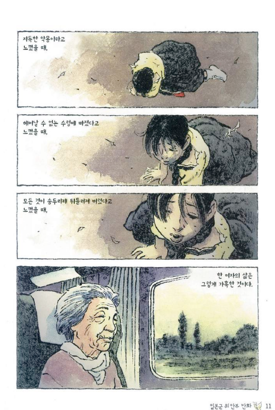
Fig. 4 Page from Kim Gwang-seong (art) and Jeong Gi-young (script) Butterfly Song (2014).