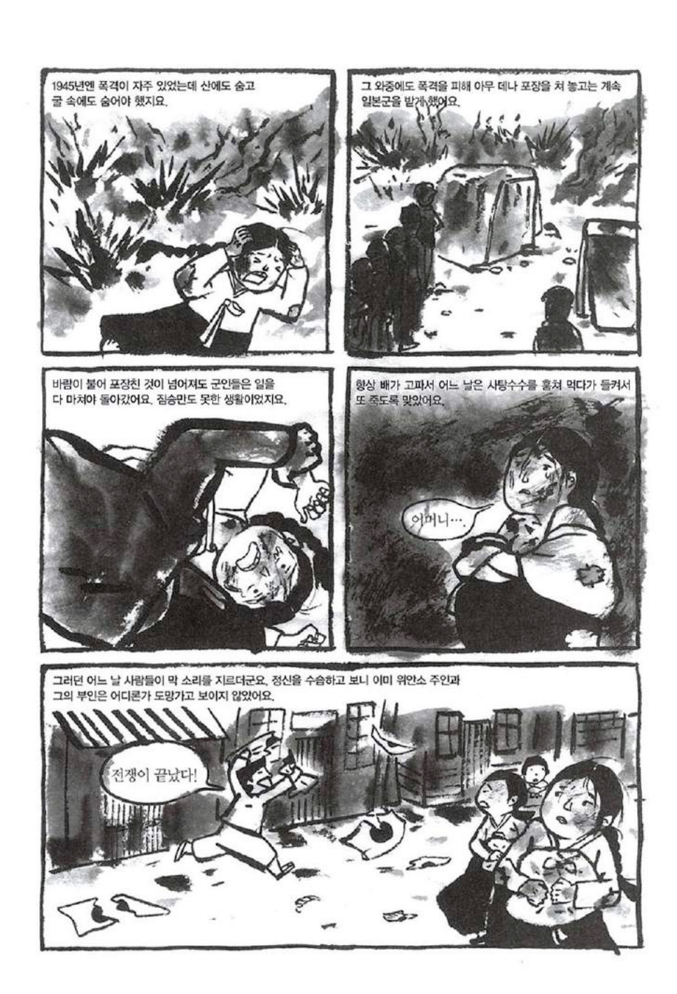
Fig. 6 Page from Geum-suk Gendry-Kim The Secret (2014).