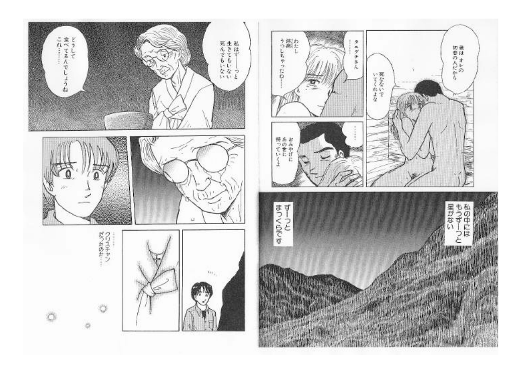
Fig. 8 Double spread from Ishizaka Kei "To Kill that Memory One Day" (Aru hi ano kioku o koroshi ni, 1996).