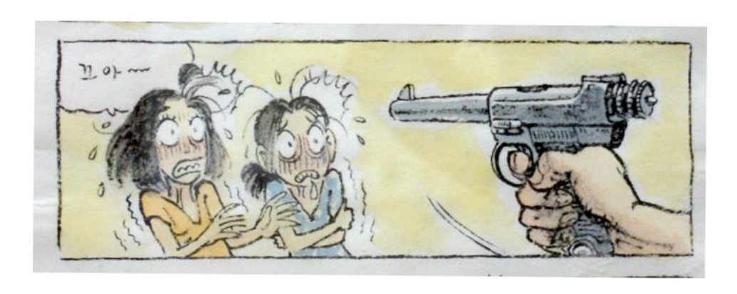
Fig. 7 Panel from Kim Gwang-seong (art) and Jeong Gi-young (script) Butterfly Song (2014).