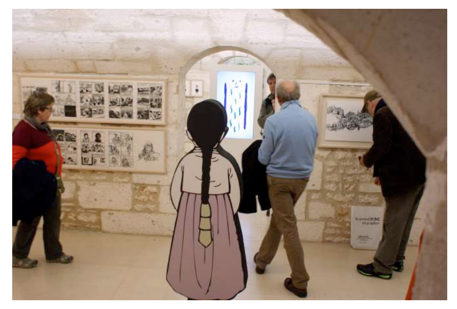
Fig. 1 Photo of the exhibition Flowers that Don't Wilt: I'm the Evidence (January 2014).