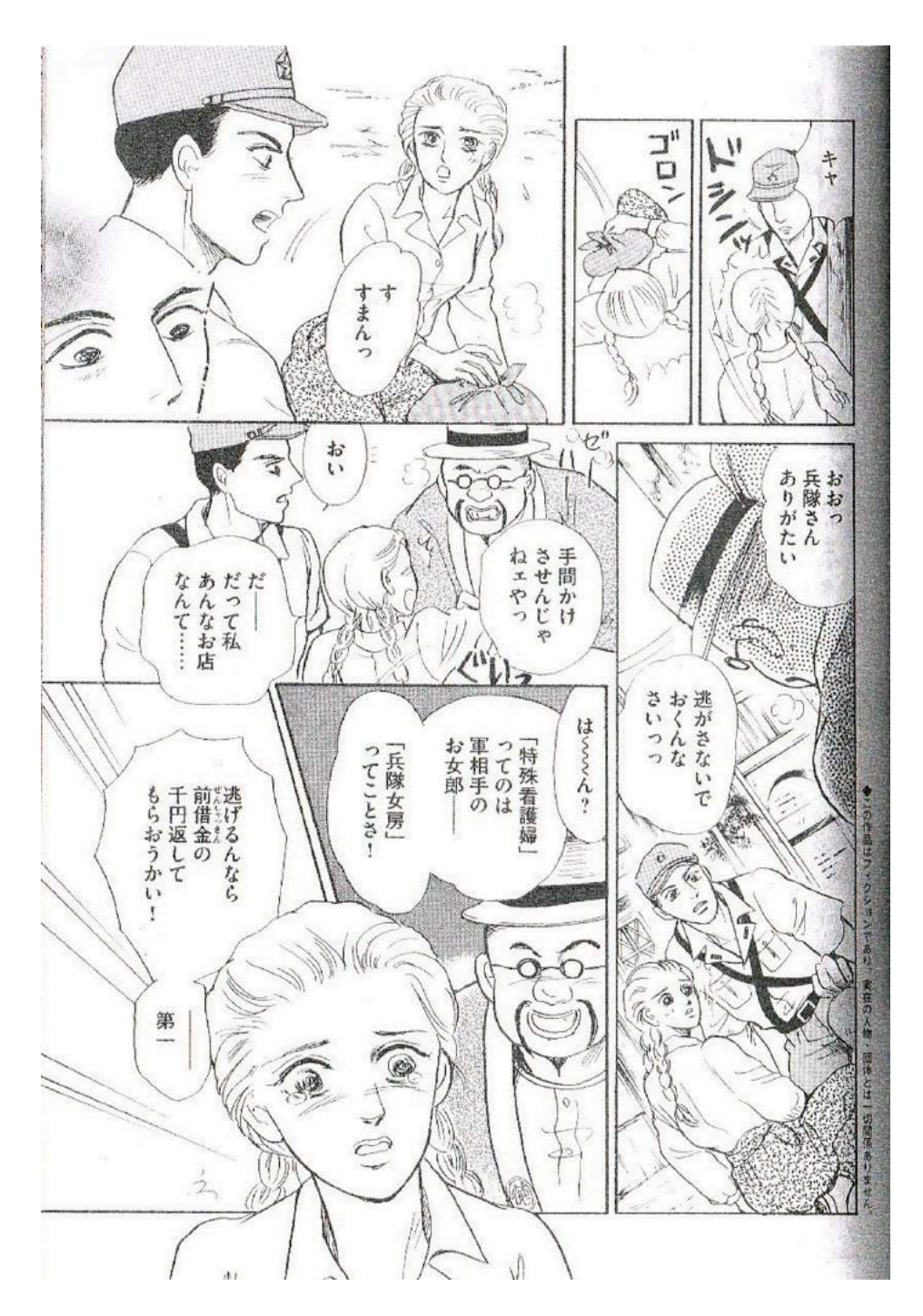
Fig. 10 Page from Yasutake Wataru "Soldier Wife" ( Heitai nyōbō , 2013).