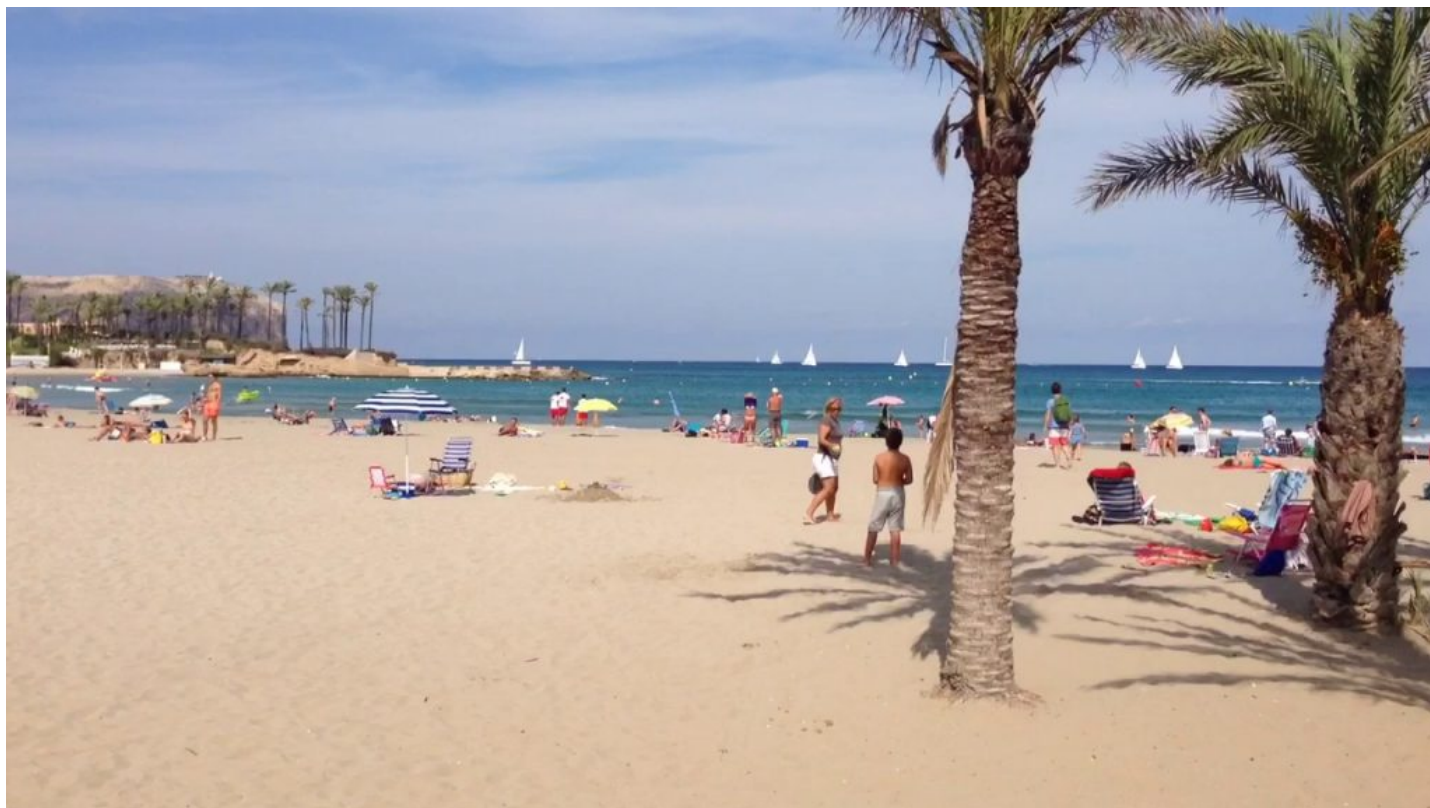
Javea Arenal Beach

‘La Playa del Arenal’ is a 450m+, golden, sandy beach, known to many as the crowning jewel of Javea. Bestowed with a ‘Blue Flag’ symbolising the environmental quality certificate given by ‘FEE’ guaranteeing optimal water conditions and being the only sandy beach in the area, the Arenal becomes a tourist hotspot in the summer months, acting as the central hub of the municipality. With a vast array of bars, restaurants and clubs, the Arenal supplies everything you could possibly need for the perfect beach day and beyond!