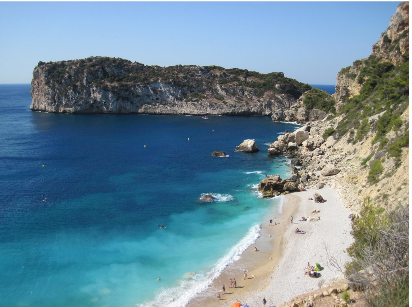
La Cala Ambolo Beach