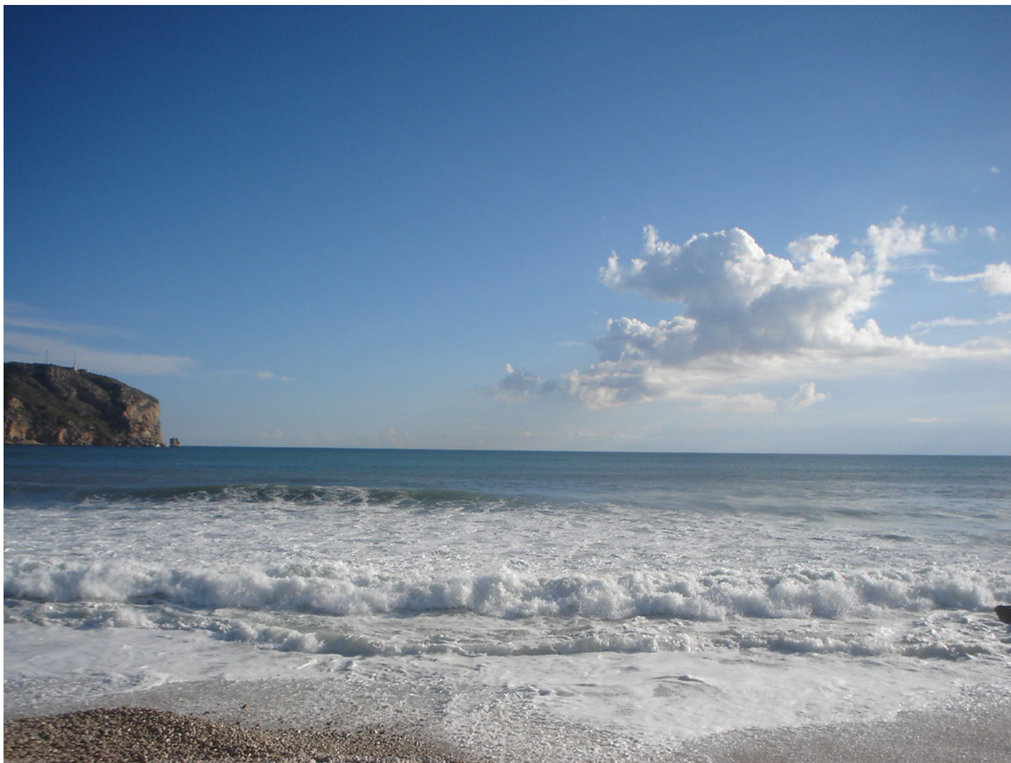
La Playa Primer Muntanyar

‘La Playa Primer Muntanyar’ , also known as ‘the Beach of the First Mountain’ is a rough stone beach, stretching just under 2km. This beach offers some of the most mesmerizing, expansive views in the whole of Javea, especially for sunrise! Traditionally, the beach’s nickname is ‘The Dawn of Spain’. Although the ‘La Playa Primer Muntanyar’ is not actually the most Northern point of the country, nor the first to be lit by the light of the sun, it still keeps this nickname, due to the astounding view every morning!