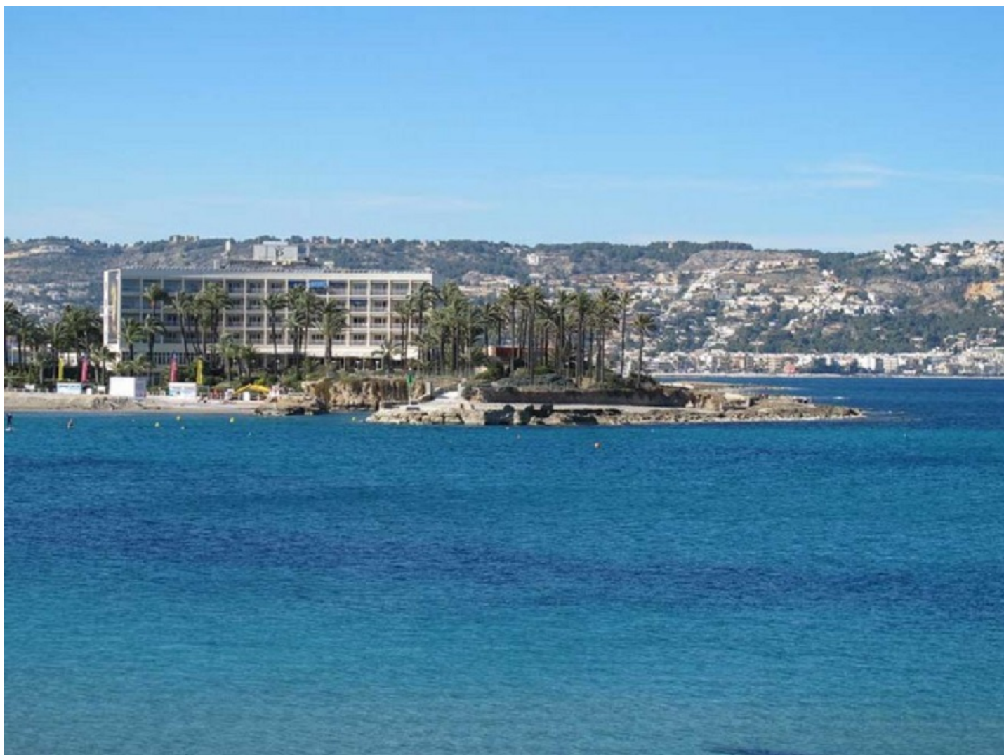
Cala del Ministre