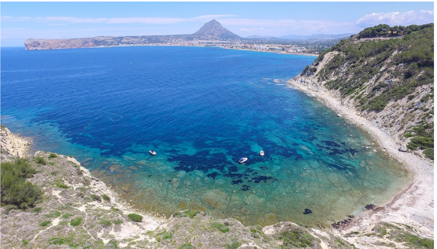
Cala Blanca Beach

Cala Blanca, also known as 'La Caleta' is a collection of neighbouring, rocky beaches, which can be found at the far end of the 'Playa del Segon Muntanyar'. The size of the beach is undetermined due to the fact that it wraps around the high cliff walls, revealing multiple private inlets, perfect for a quiet day in the sun!