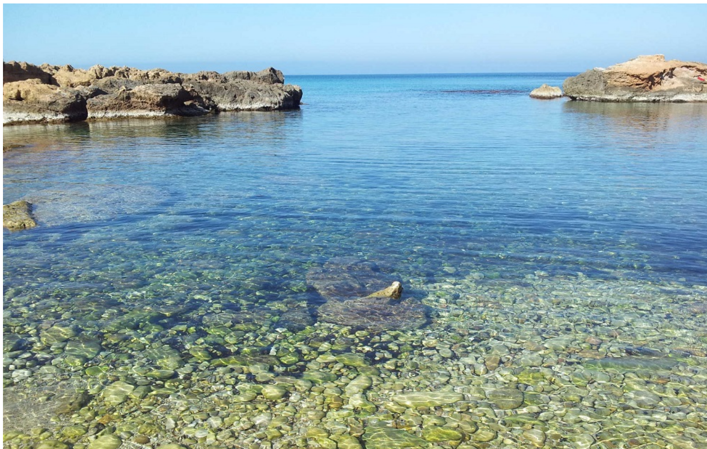
La Cala Sardinera Beach

La Cala Sardinera beach or Sardine Bay , is a 200m long, beautifully picturesque bay, situated on the north face of 'Cap Prim'. The bay's name originates from the large number of sardines that would gather and be caught by fishermen in these waters, in years gone by. There are many buoys off the shoreline of the beach, meaning in summer it can very quickly become one of the most popular destinations for tourists and locals to drop their anchors and settle in for the day!