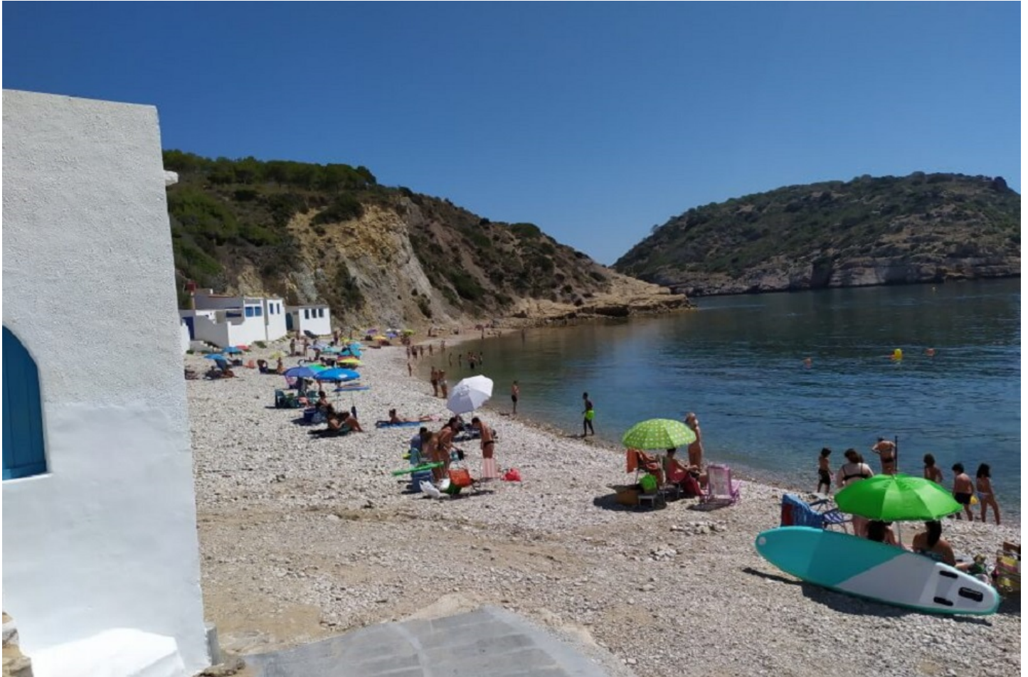
Cala Portitxol Beach

Cala Portitxol or Portitxol beach , also known as Cala de la Barraca or Barraca Beach , is a beautiful pebble beach, stretching approximately 900 meters with spectacular views of the Mediterranean Sea and the Isla del Portitxol. The cove is bordered either side by the cliffs of Cap Negre and Cap Prim, only adding to the picturesque landscape.