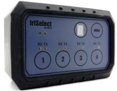
Additional user features can be controlled by the iriSelect control unit. (optional extra)

Take full advantage of the iriSelect control unit, by defining extra MODE's. Default standard MODE 0 is a full open mode, where everybody can hear everybody, and does not require an iriSelect. The iriSelect MODE switch selects up to 9 more (MODE 1-9) preset audio routing schemes (modes), which is instantly sent to iriSound. Each mode defines the complete port-to-port routing of all audio. For example, you can setup separate intercom nets (groups) and assign individual radios to each net, or any number of radios.*