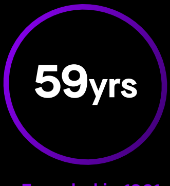
Founded in 1961