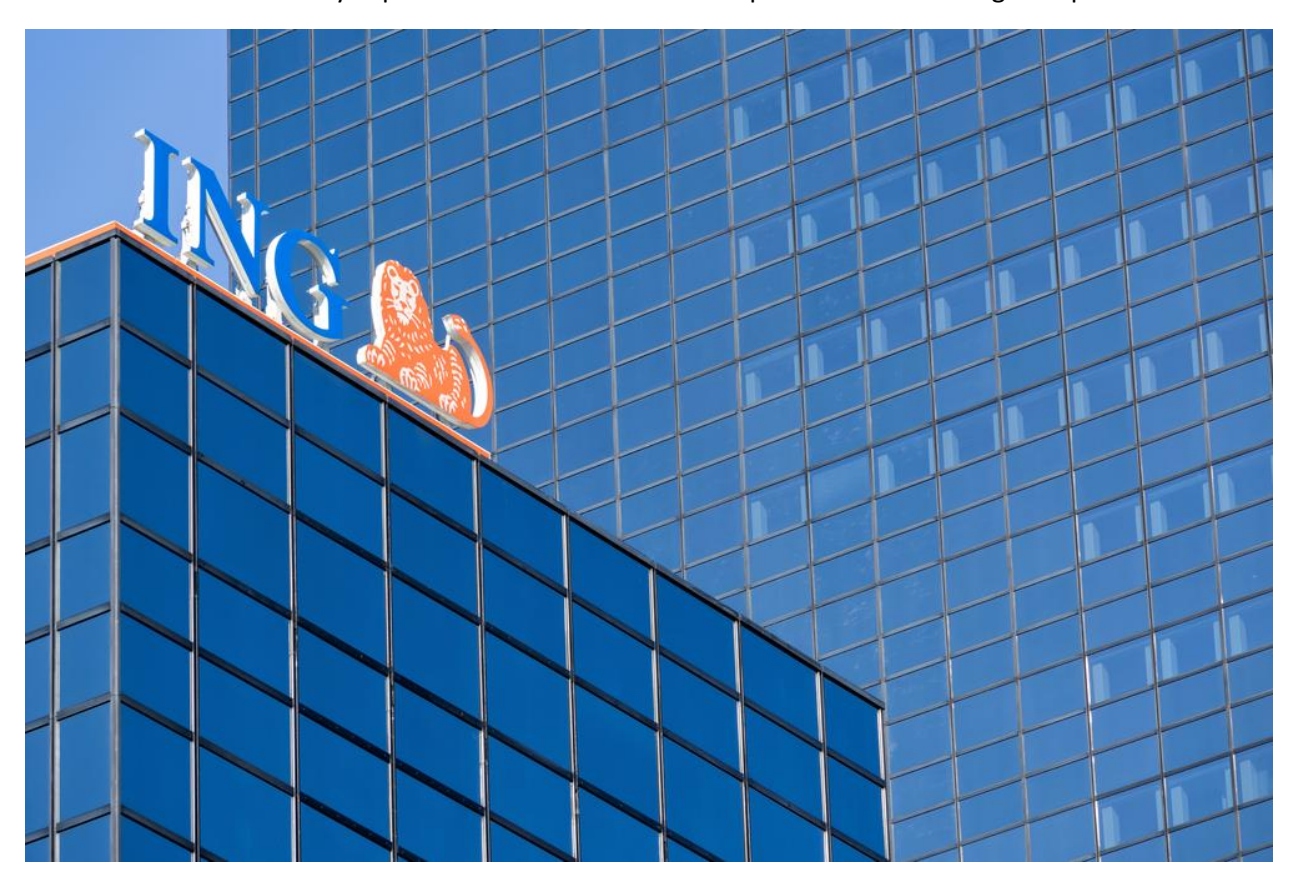
ING is one of the 'big four' in the Dutch banking sector.