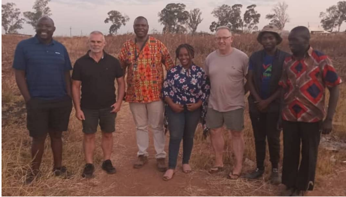
ICIS team with Village of Life Foundation at a possible sight to build a school in Sanyati Zimbabwe