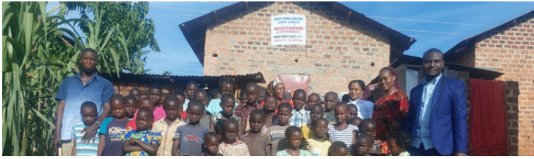
A group photo for both children and team member at Vine Yard Junior School.