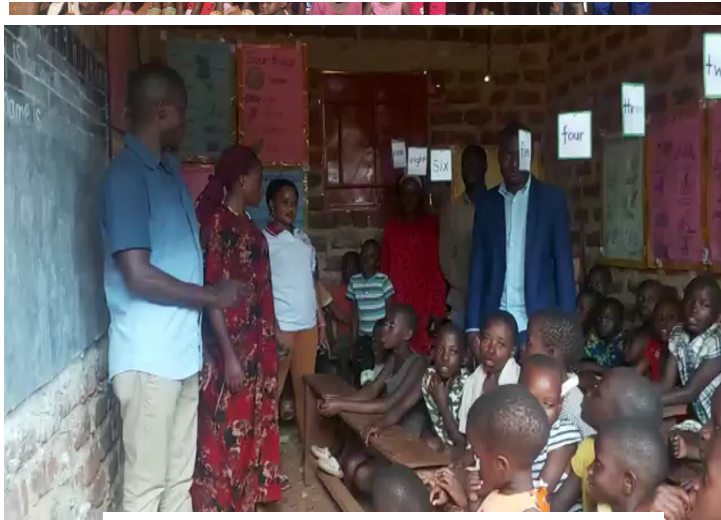
Children receiving some education