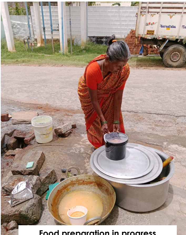
Food preparation in progress