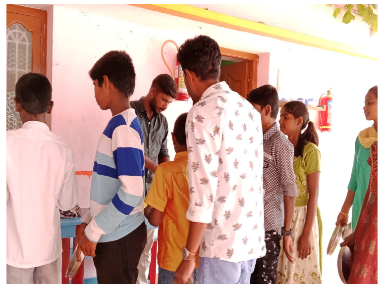
People receiving meals

I Care so I Share thrives to make a difference as statistics shows that many people in the nation are hungry. Hunger is an epidemic that can easily be solved with resource distribution. We believe that hunger is not an issue of charity. It is an issue of justice. It is an eternal obligation toward the human being not to let him suffer from hunger when one has a chance of coming to his assistance. If we can conquer space, we can conquer childhood hunger. We continue working to providing hot meals and other food stuffs to the less privileged comprising the Orphans and Semi Orphans in VidhyaNiketan Orphanage