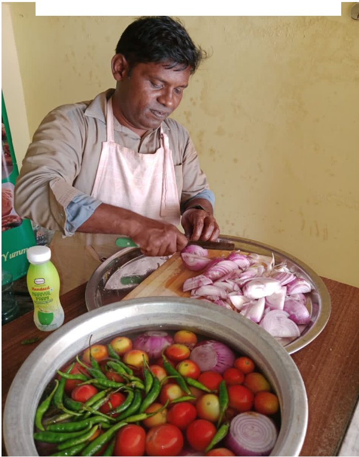
Feeding of Orphans and Semi Orphans in Vidhya Niketan Orphanage and community outreach in Pakistan