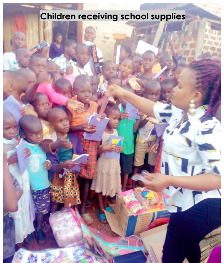
Children receiving school supplies

We are thrilled with the work in Uganda. We are currently impacting children's lives in different ways. We continue being oriented on equipping the children with the value of education mainly in technical services. ICIS thrives to make street children have something they do to reduce redundancy. Incorporating them elevates their standard of living. We continue motivating the orphans intrinsically and extrinsically as we help them realize their dreams. We are oriented to continue supporting Young Dreams project through tuition fees, school supplies and school uniforms. In as much as we are doing our best to make a difference; our hands are open for support. Glory be to God forever!