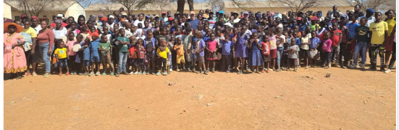
A group of children, guardians and community leaders in Sanyati and Village of Life Foundation visitors