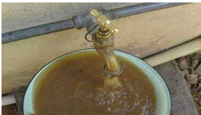
Cholera related deaths continues in Zimbabwe amid the crisis.