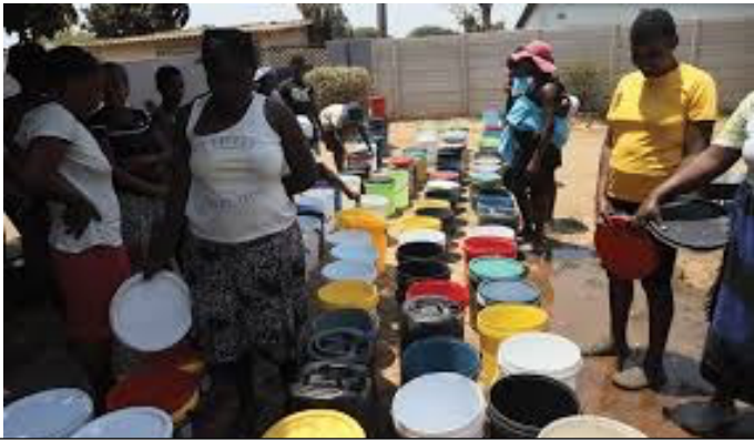
On the above caption; Community fetching clean water at our House of Hope Children's Home from nearby communities