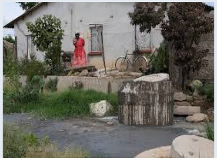
Sewage flowing everywhere

Busted unrepaired sewage flowing everywhere is also a major cause of concern amid Cholera outbreak crisis. Sewage flowing near communities we are serving, living children under our care at risk. It is really a major cause of concern as we would need all the kids to be safe.