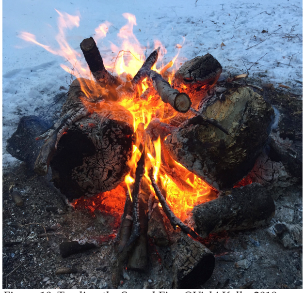
Figure 10: Tending the Sacred Fire.

All My Relations. We are All Related. Aaniin