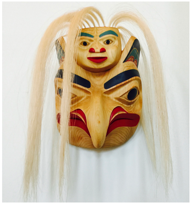
Figure 9: Becoming Thunderbird. Made of Alder tree, acrylic paint, horse hair.

Gitchie Manitou pondered what Mi-gi-zi had to say. Creator then instructed the spiritual being to hold back his fury. Gitchie Manitou entrusted Mi-gi-zi, Eagle, with the duty of reporting to him each day the condition of the Earth's people. The miracle of the sunrise happened again for the Anishinaabe. We owe our lives and lives of our children to Eagle. This is why Mi-gi-zi, Eagle, is so respected by Indigenous people everywhere. This is why the Anishinaabe People make a whistle from the wing bone of the eagle. They sound the whistle four times at the start of their ceremonies. They do this to remember Our Relative, Mi-gi-zi, Eagle, his teaching and the role he plays in the preservation of the Earth and the People, The Anishinaabe.