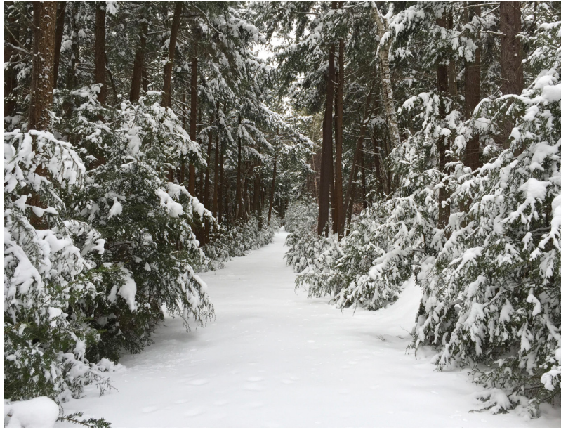
Figure 3: Path to Quetican or "Place of Unusual Beauty."