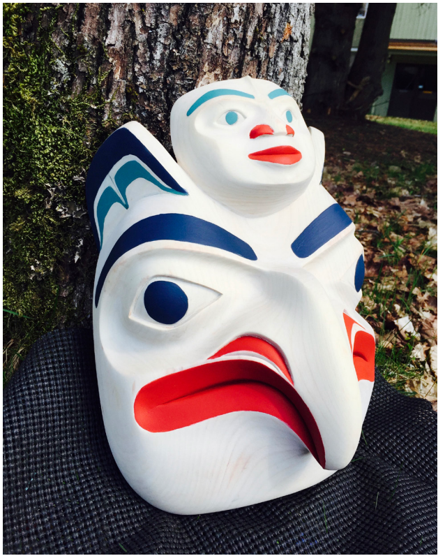
Figure 8: Becoming Thunderbird is awakening.