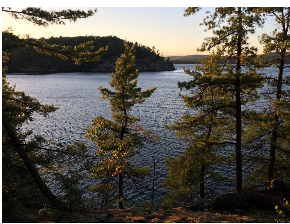
Figure 2: Lake Lauzon called "Bindewaagagin" meaning "Lake between the Lakes" by the Mississauga (Anishinaabek).

(Cajete, 1994, 2015) is found in all the teaching stories of the Anishinaabe People. Through them we learn how to be the best