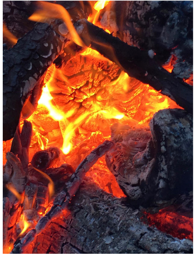
Figure 11: Becoming the Offering.

For life's sake All Our Relations Aaniin