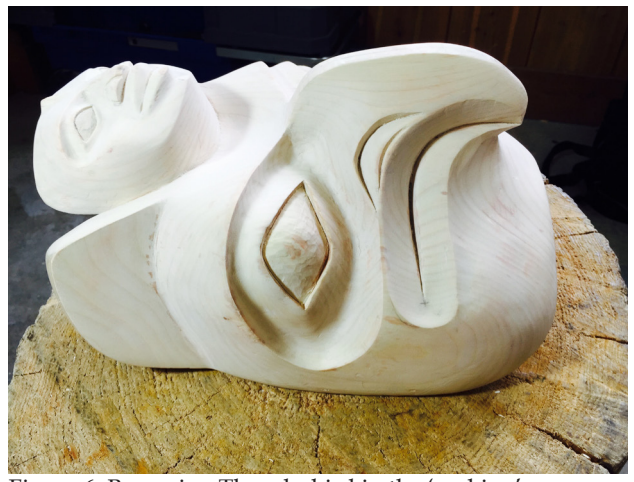
Figure 6: Becoming Thunderbird in the 'making'.

Finally, there are multiple modes or modalities for this process of Indigenous Poiesis; there are infinite paths and ways to walk this journey to the centre of our everyday lives. This process of the "ceremony of making" has been a part of all cultures and communities. It is also a very long and arduous quest of learning to be human that has been going on for millennia.