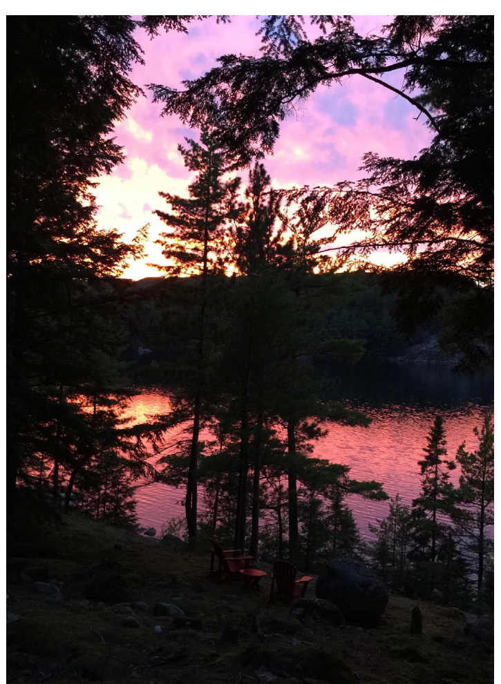
Figure 4: Stillness, Lake Lauzon called "Bindewaagagin" meaning "Lake between the Lakes" by the Mississauga (Anishinaabek).