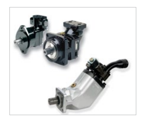
PUMPS & MOTORS