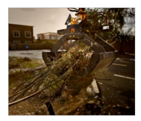
ATTACHMENTS & ACCESSORIES