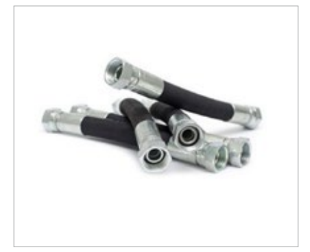
HOSES & FITTINGS