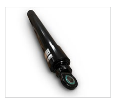
DOUBLE ACTING & TELESCOPIC CYLINDERS