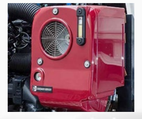
HYDRAULIC OIL COOLER / HYDRAPAK