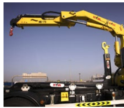
HYVA-TRUCK MOUNTED CRANES