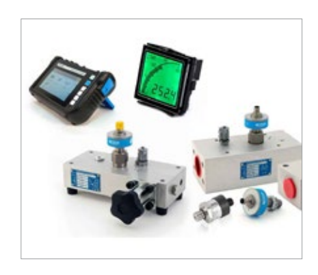
TEST STAND INSTRUMENTATION