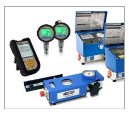
PORTABLE TEST EQUIPMENT