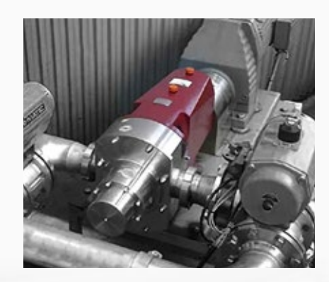
LIQUID TRANSFER PUMPS