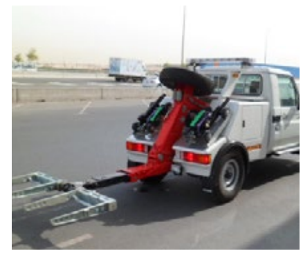
RECOVERY & TOWING SOLUTIONS