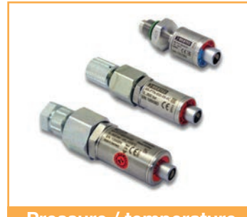
Pressure / temperature sensors