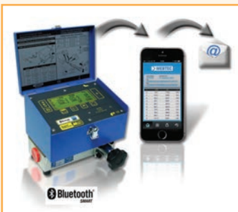
DHM '4' Series