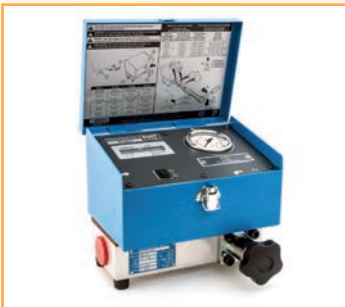
DHT '1' Series