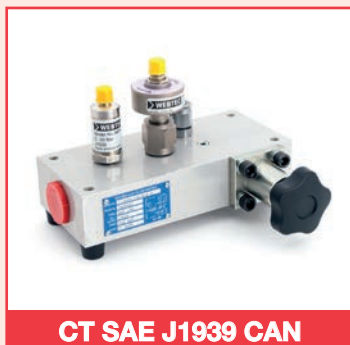
CT SAE J1939 CAN