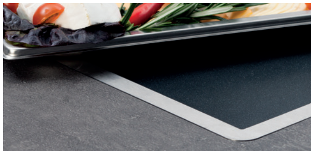
Integrated aluminium cooling surface with heavy-duty coating

Continuous impact protection provides extra efficient protection against damage for the device, walls and doors.