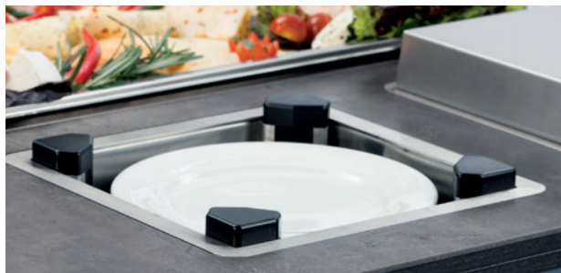
Crockery stacking compartment for safe transportation and comfortable dispensing