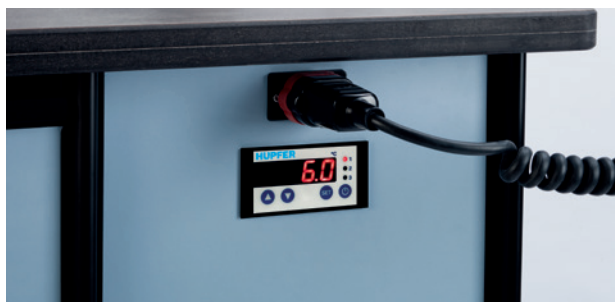
Power supply and control unit for controlling the operating mode