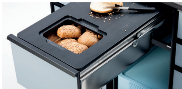
Cover plate acts as practical cutting board