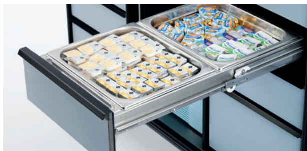
Cooled drawers with self-retracting soft close mechanism