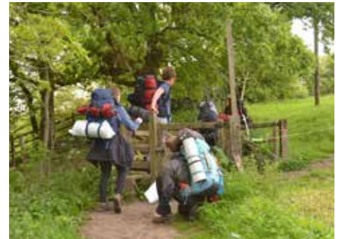
D of E