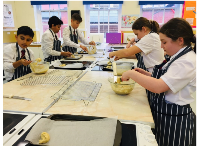
Year 7 used convection as a heat transfer method to make rock buns this week!

With the winter months approaching, we are also emailing a copy of our School Closure Policy. Although I hope we will not have to use it, I would ask that you remind yourself of the procedure, which is also available on the policies section of the school website.